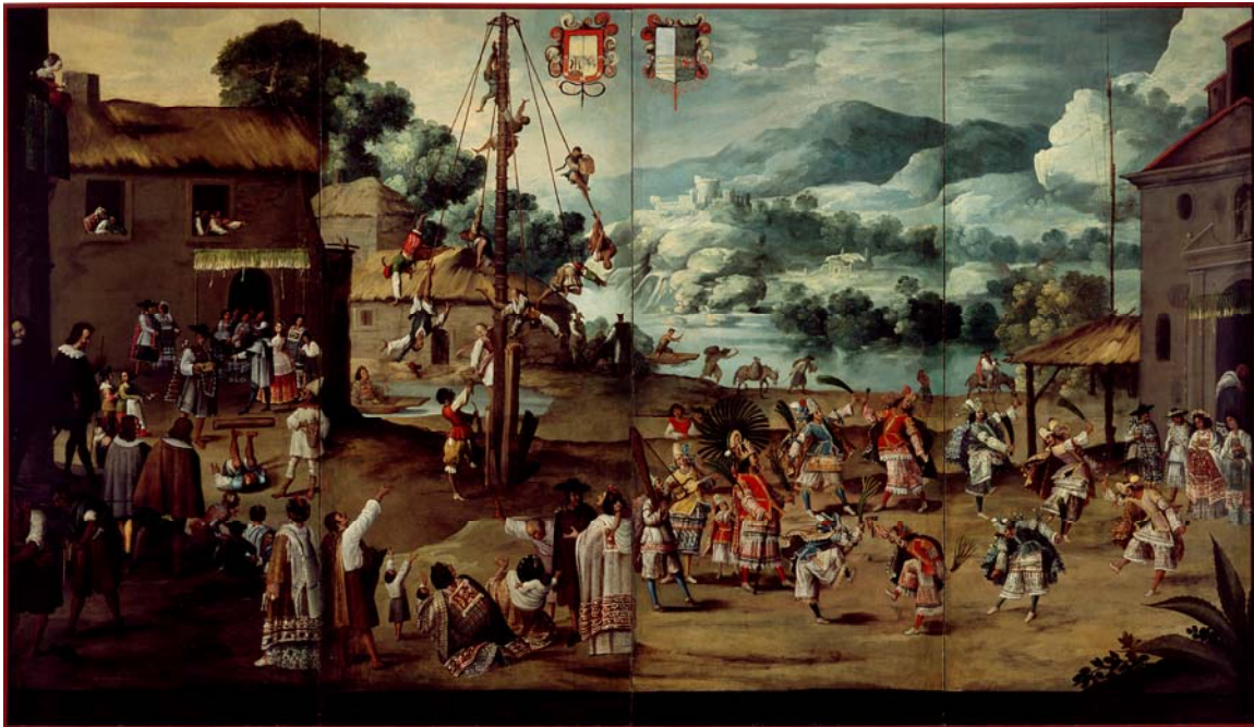
FOLDING SCREEN WITH INDIAN WEDDING AND FLYING POLE (BIOMBO CON DESPOSORIO INDÍGENA Y PALO VOLADOR)

Mexico, circa 1690, oil on canvas, overall: 66 x 120 in.