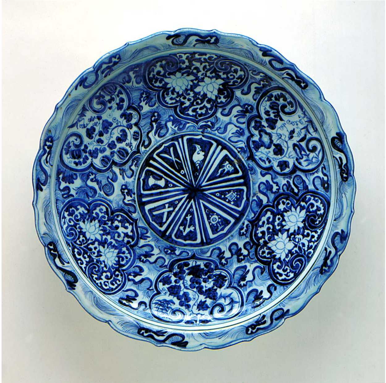
China, Jiangxi Province Foliated Platter (Pan) with the Eight Buddhist Symbols (Bajixiang), Flowers, and Waves Late Yuan dynasty, c. 1340–68 Molded porcelain with blue painted decoration under clear glaze Height: 2¼ in.; diameter: 17¾ in. Los Angeles County Museum of Art, Gift of the Francis E. Fowler, Jr. Foundation and the Los Angeles County Fund (55.40)