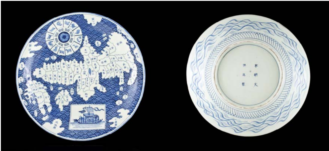
CHARGER WITH JAPANESE MAP DESIGN Japan, Tenpo era, circa 1830–1843 Porcelain with blue underglaze, 3 x 19 in. Los Angeles County Museum of Art Gift of Allan and Maxine Kurtzman (M.2000.52)

The Silk Road introduced luxury goods to a large international market, creating a demand and also a market for imitations. The kind of blue-and-white ware seen in the Foliated Platter (page 4) inspired countless variations until well into the nineteenth century and even today. From elaborate serving pieces to small, decorative tiles, blue-and-white ware was made for the middle classes and royalty alike. And it all began in the exchange of products by merchants working their way along the Silk Road centuries before.