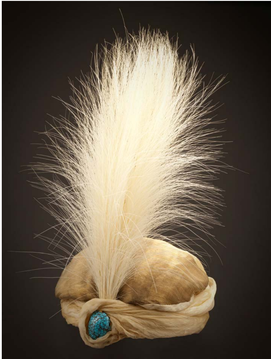
PAUL POIRET (1880–1944) Woman's Turban, 1911