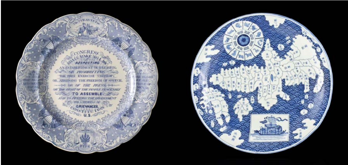
THE TYRANT'S FOE, THE PEOPLE'S FRIEND England, Staffordshire, circa 1820–1840 Earthenware, blue transfer printed, Diameter: 10½ in. Los Angeles County Museum of Art Gift of the Hearst Corporation (50.28.23)