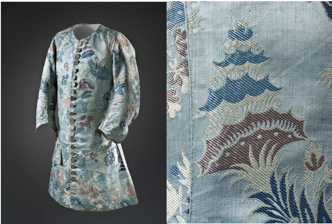
MAN'S SLEEVED WAISTCOAT

represented in Fashioning Fashion is similar to our own. The Old World was being rocked by the forces of revolution, global trade expansion, and technical advances. Cross-cultural exchange contributed to the evolution of textiles, tailoring techniques, and trimmings.