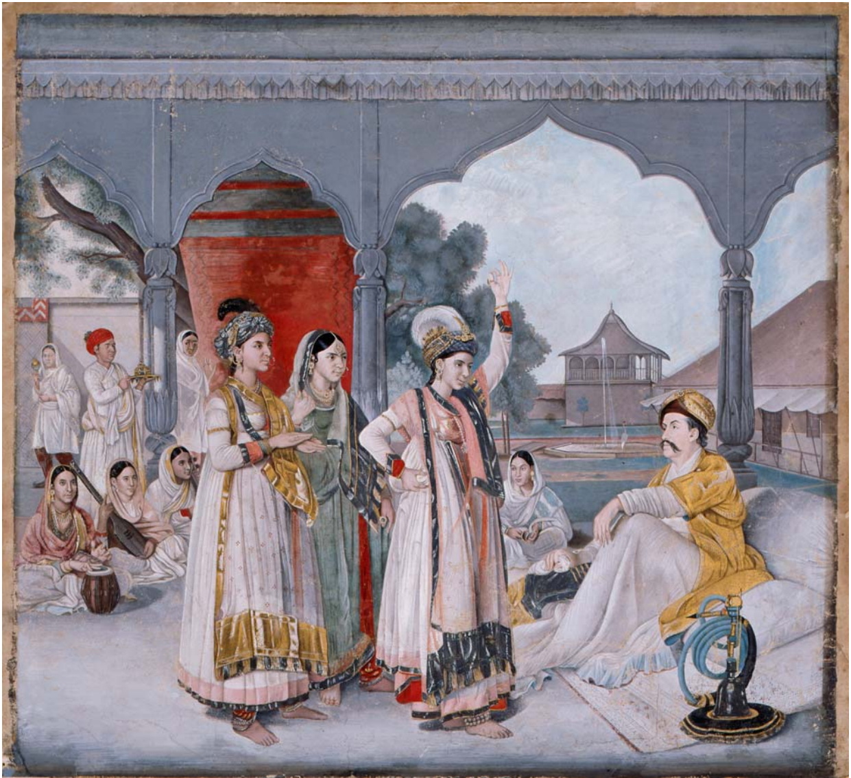
Colonel Antoine-Louis Henri Polier Watching a Nautch, after a Painting by Johann Zoffany India, Uttar Pradesh, Faizabad or Lucknow, c. 1786–88

Opaque watercolor on paper, 9\frac{13}{16} \times 12\frac{5}{8} in.