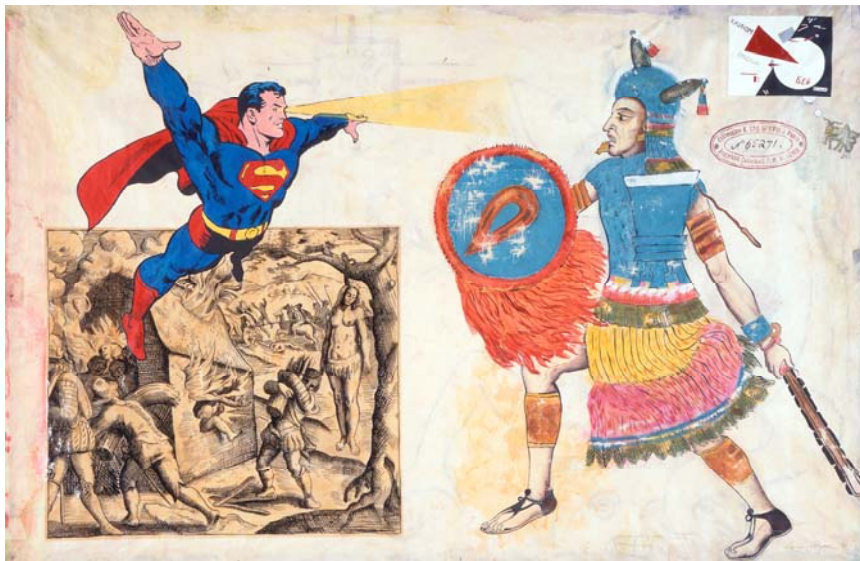
ENRIQUE CHAGOYA (Mexico, born 1953)

Uprising of the Spirit (Elevación del espíritu) , 1994