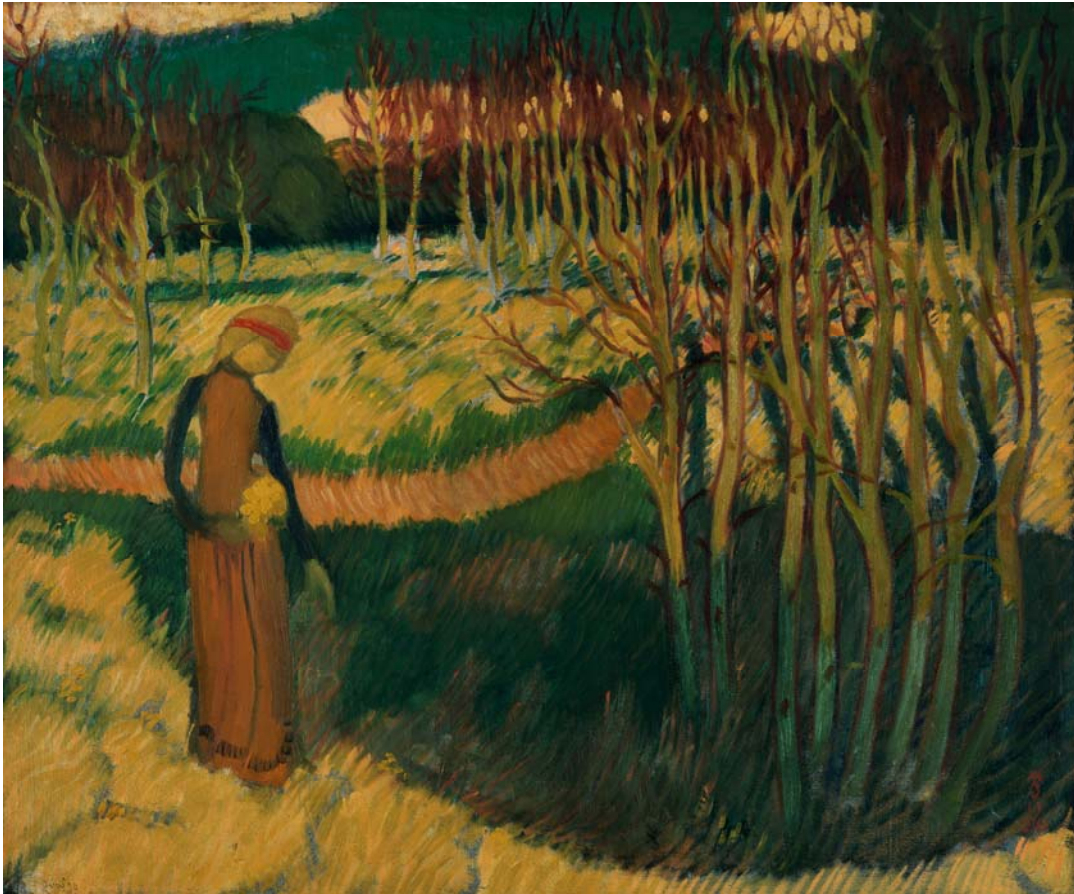
MAURICE DENIS (France, 1870–1943) Motif Romanesque, 1890 Oil on canvas, 17 1/8 x 25 3/8 in. Los Angeles County Museum of Art Wallis Foundation Fund in memory of Hal B. Wallis, AC1995.91.1

Along with Pierre Bonnard, Maurice Denis was a member of the artists' group known as the Nabis that explored form and color apart from their representational qualities. Broad areas of saturated color, thick outlines, and bold patterns define their work.