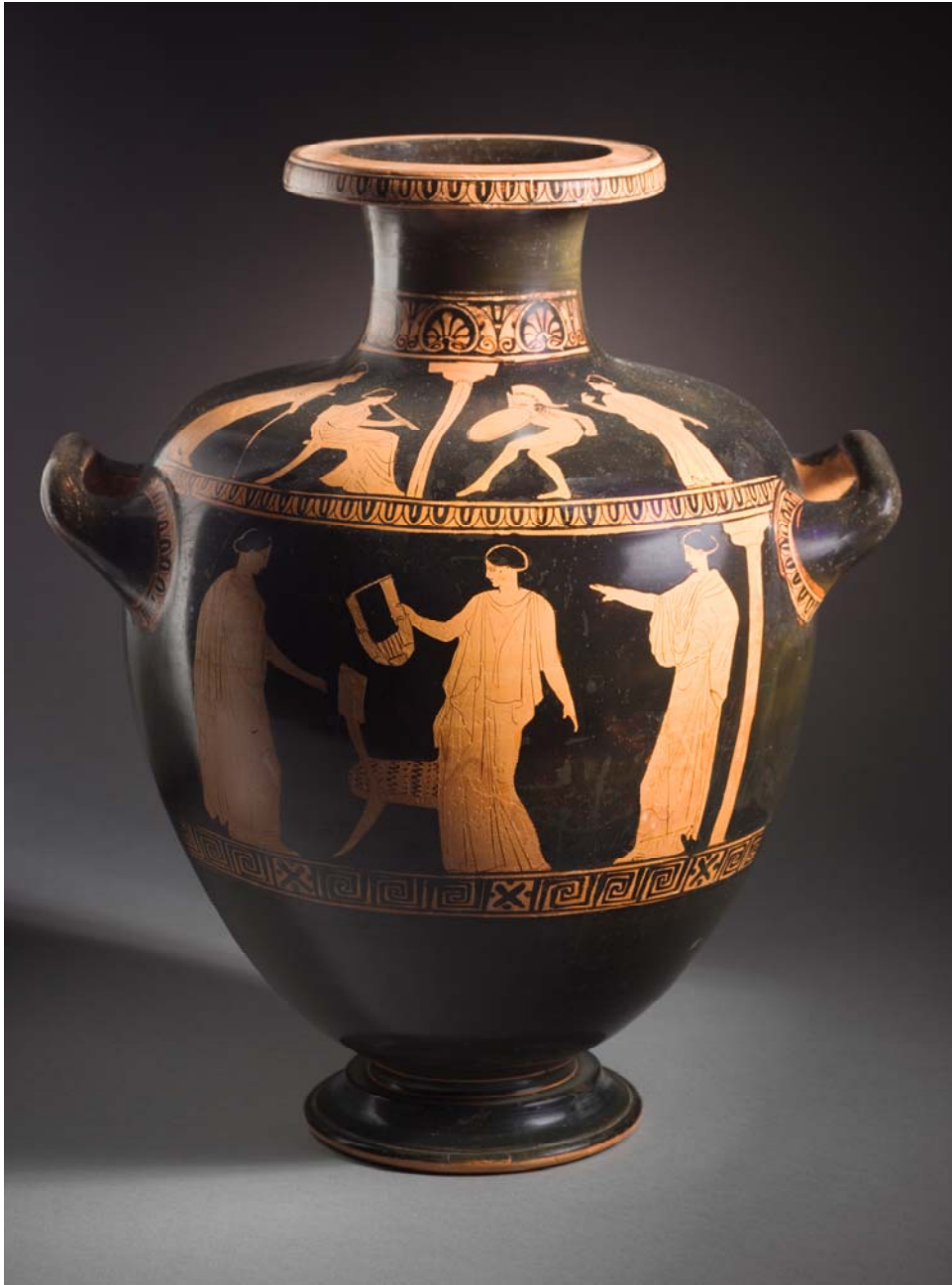
ATTRIBUTED TO THE GROUP OF POLYGNOTOS Attic Red-Figure Hydria with (shoulder) a Dancing Warrior, Accompanied by a Woman Playing the Pipes, and (body) Two Women Facing a Woman Holding a Kithara, circa 440 B.C. Ceramic, 15 x 13 in., Los Angeles County Museum of Art Gift of Mr. and Mrs. Spiros G. Ponty, M.77.48.2

Look closely at the vase above. In what ways are the figures on the vase similar to the figure in Picasso's Woman with Blue Veil ? How has Picasso reinterpreted the Attic red-figure style?