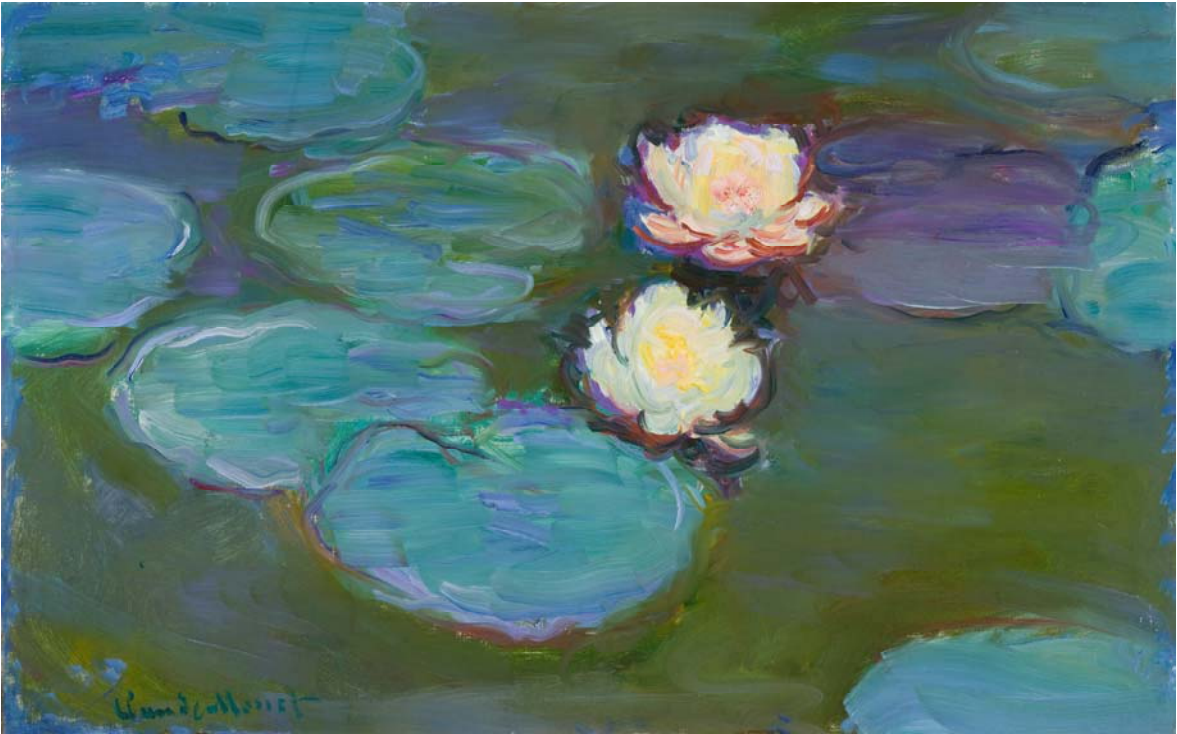
CLAUDE MONET (France, 1840–1926) Nymphéas , circa 1897–98 Oil on canvas, 26 x 41 in. Los Angeles County Museum of Art Mrs. Fred Hathaway Bixby Bequest, M.62.8.13