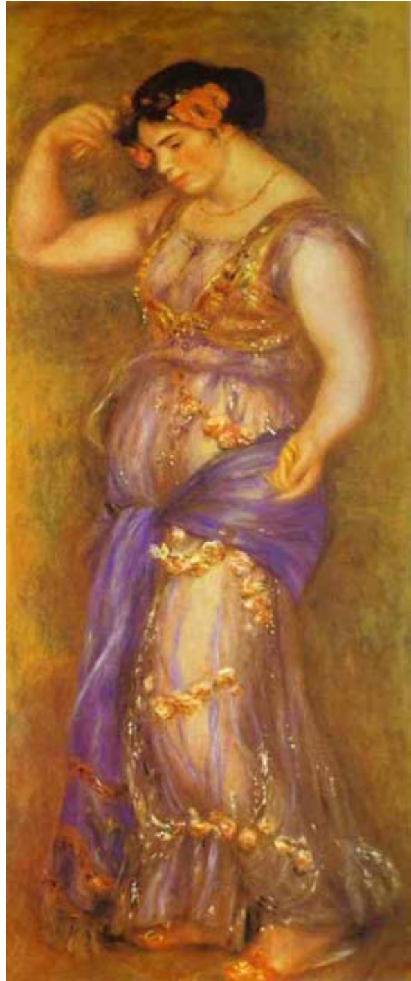
Pierre-Auguste Renoir (France, 1841–1919) Dancing Girl with Castanets , 1909 Oil on canvas, 61 x 25 1/2 in. The National Gallery, London, purchased 1961 Photo © 2009 National Gallery, London (NG6318)