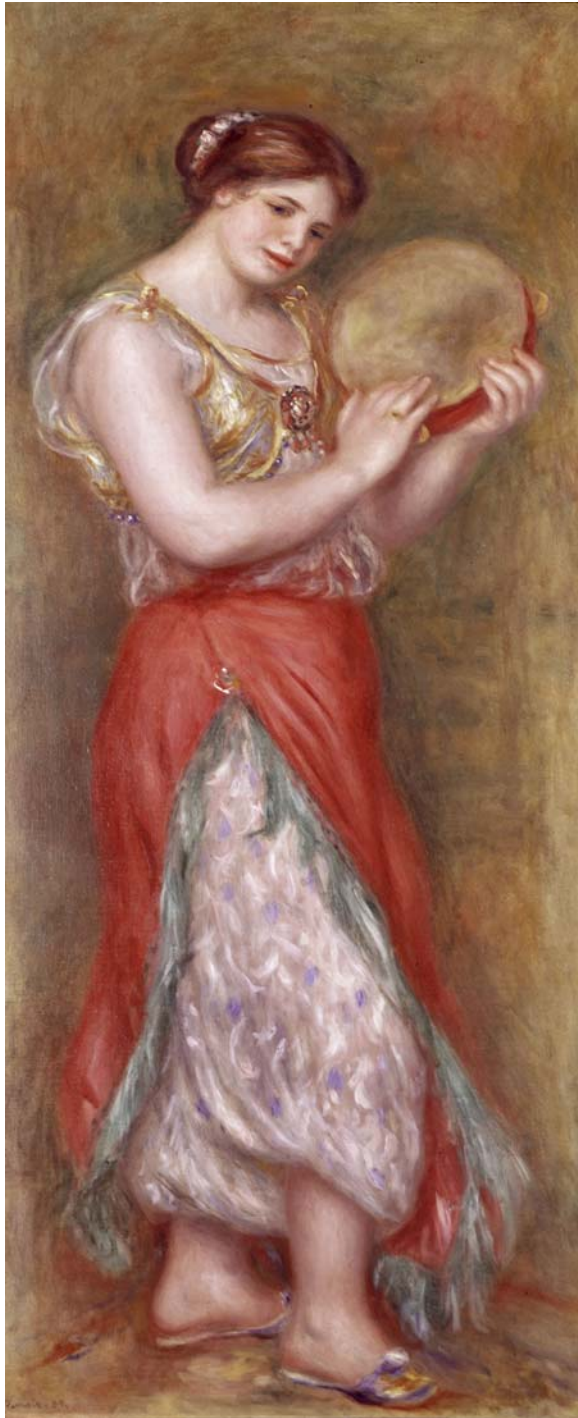
Pierre-Auguste Renoir (France, 1841–1919) Dancing Girl with Tambourine , 1909 Oil on canvas, 61 x 25 1/2 in. The National Gallery, London, purchased 1961