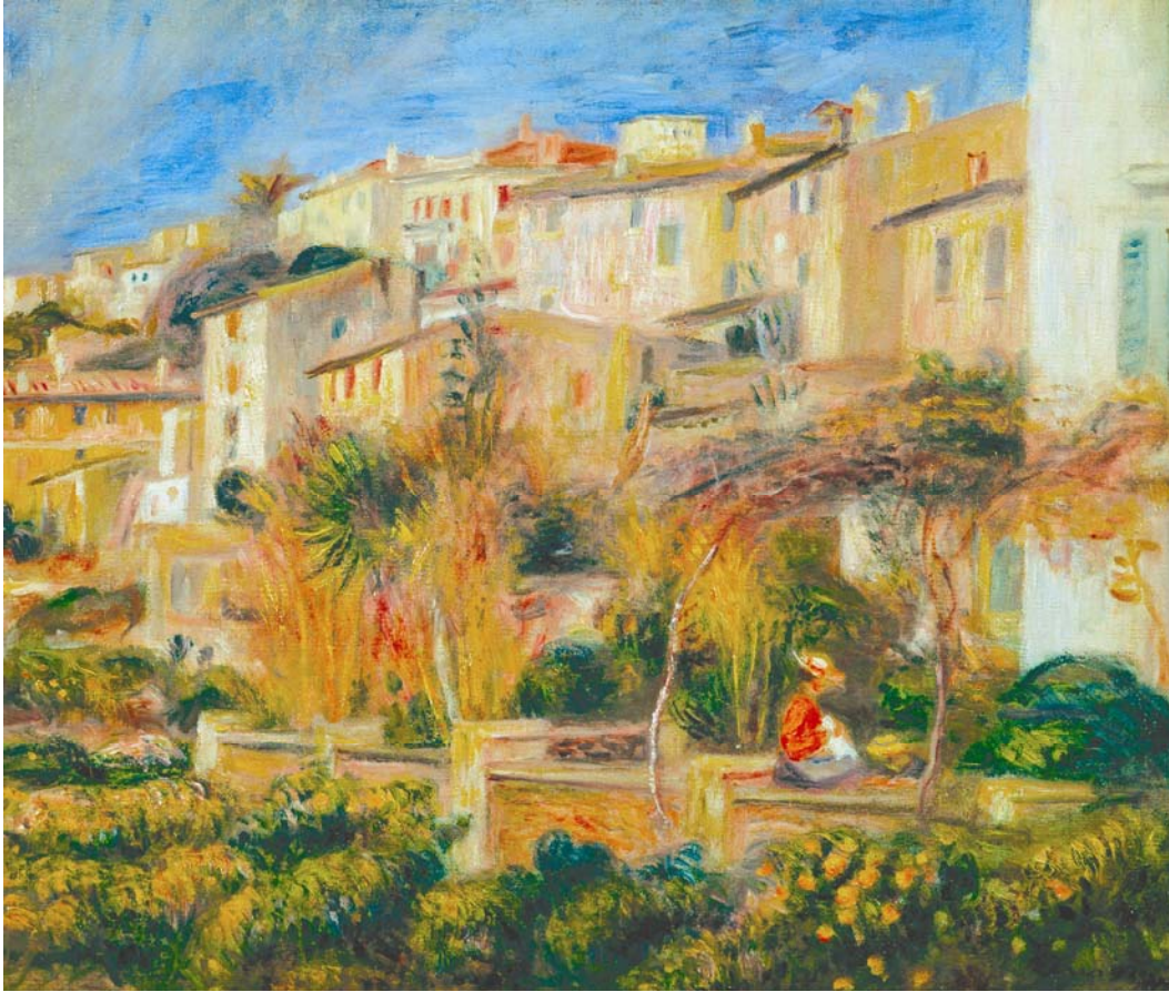
PIERRE-AUGUSTE RENOIR (France, 1841–1919) Terrace at Cagnes , 1905 Oil on canvas, 18 x 21 7/8 in.

Bridgestone Museum of Art, Ishibashi Foundation, Tokyo