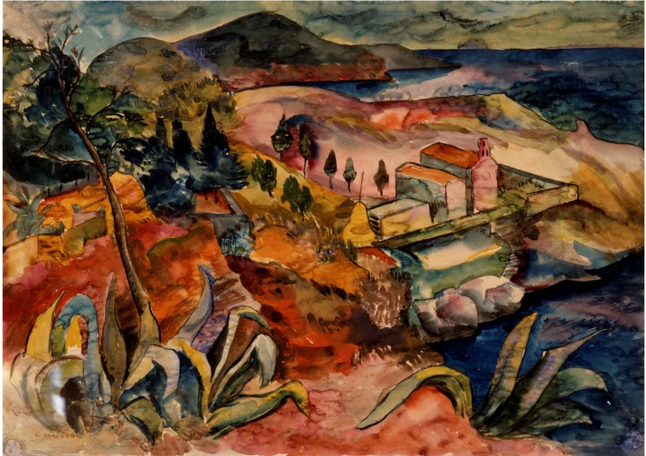
Pierre Bonnard (France, 1867–1947) Landscape by the Sea , n.d. Watercolor, 12 x 16 7/8 in. Los Angeles County Museum of Art Gift of Mrs. Harold M. English, in memory of Harold M. English, 58.23.1