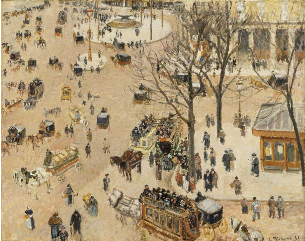
CAMILLE PISSARRO (Virgin Islands, 1830–1903, active France) La Place du Théâtre Français , 1898 Oil on canvas, 28 1/2 x 36 1/2 in. Los Angeles County Museum of Art Mr. and Mrs. George Gard De Sylva Collection, M.46.3.2