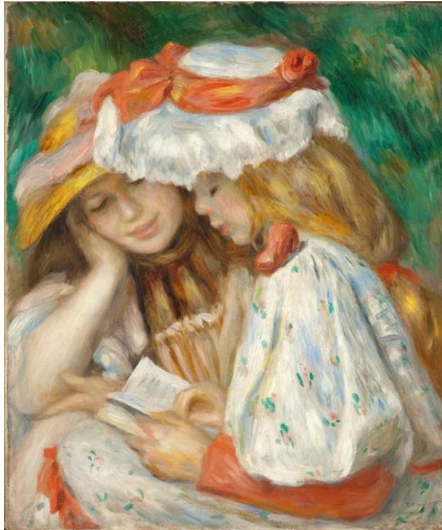
Pierre-Auguste Renoir (France, 1841–1919) Two Girls Reading , c. 1890–91, Oil on canvas, 22 5/16 x 19 in. Los Angeles County Museum of Art Frances and Armand Hammer Purchase Fund, M.68.46.1.

Impressionists represented life in modern France in intimate or informal portraits of people, landscapes, and cityscapes of the newly constructed boulevards and train stations. If you were to create an artwork that embodies contemporary life, what images, objects, or events would you represent?