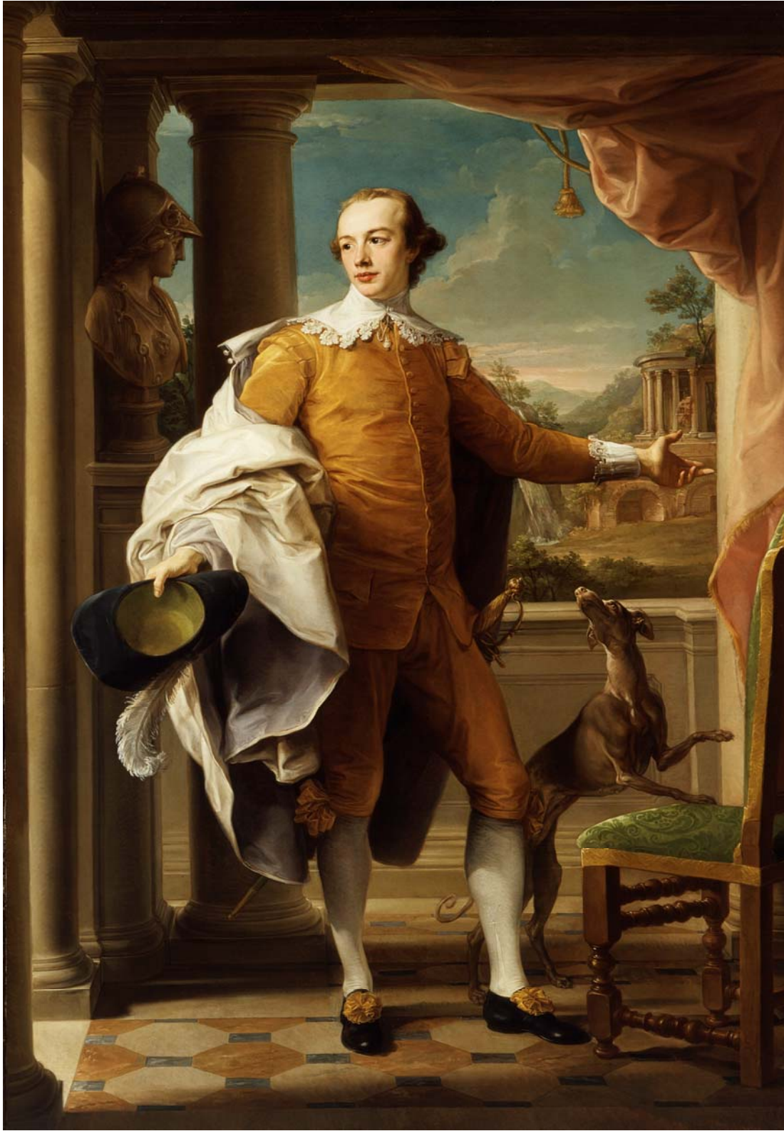
Pompeo Batoni (Italy, 1708–1787) Portrait of Sir Wyndham Knatchbull-Wyndham, 1758–59 Oil on canvas, 91¼ x 63½ in. Los Angeles County Museum of Art, Gift of the Ahmanson Foundation, AC1994.128.1