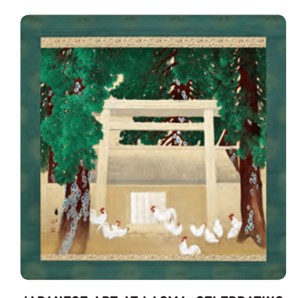
JAPANESE ART AT LACMA: CELEBRATING 10 YEARS OF THE JAPANESE ART ACQUISITIONS GROUP Through May 7 Pavilion for Japanese Art