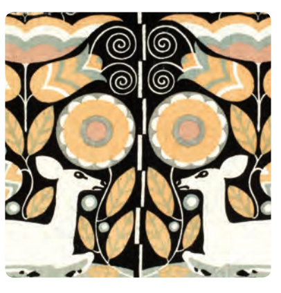
APOSTLES OF NATURE: JUGENDSTIL AND ART NOUVEAU Through April 23 Ahmanson Building