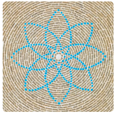
Y.Z. KAMI: ENDLESS PRAYERS Through March 19 Ahmanson Building