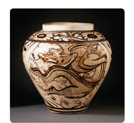
CHINESE CERAMICS FROM THE LOS ANGELES COUNTY MUSEUM OF ART Opens January 24 Vincent Price Art Museum, Monterey Park