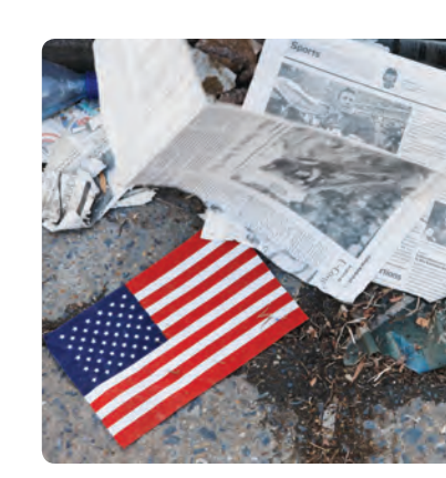
L.A. EXUBERANCE: NEW GIFTS BY ARTISTS Through April 2 BCAM