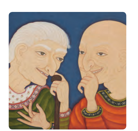
THE ENIGMATIC IMAGE: CURIOUS SUBJECTS IN INDIAN ART Through March 12 Ahmanson Building