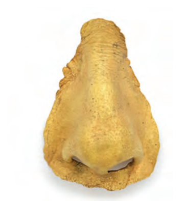
BEYOND BLING: JEWELRY FROM THE LOIS BOARDMAN COLLECTION Through February 5 Ahmanson Building