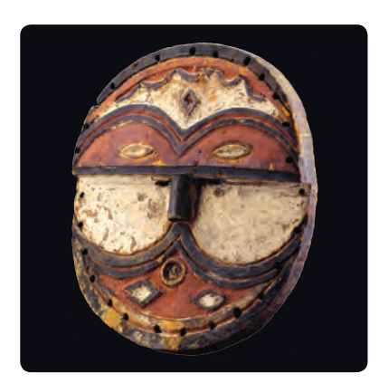
THE INNER EYE: VISION AND TRANSCENDENCE IN AFRICAN ARTS Opening February 26, 2017 Member Previews: February 23–25 Resnick Pavilion