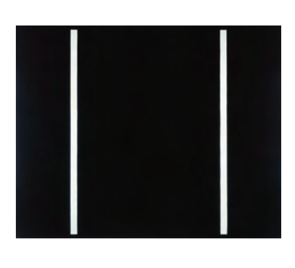
JOHN McLAUGHLIN PAINTINGS: TOTAL ABSTRACTION Through April 16 BCAM