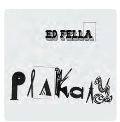
ED FELLA: FREE WORK IN DUE TIME Opens January 14 Art of the Americas Building