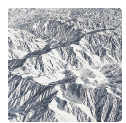
TOBA KHEDOORI Through March 19 BCAM