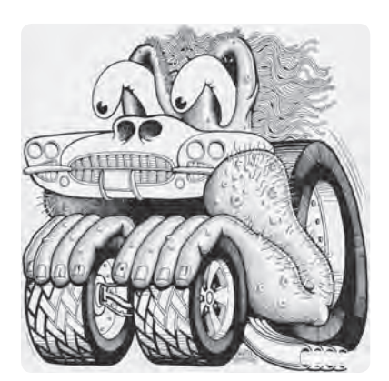
CARTOONS: ART OF AMERICA'S CAR CULTURE Through January 2 Art of the Americas Building