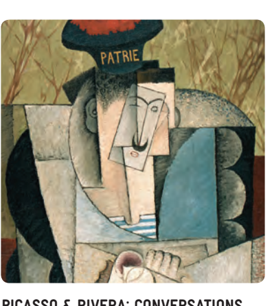
PICASSO & RIVERA: CONVERSATIONS ACROSS TIME Through May 7 BCAM