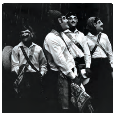
MARIANA YAMPOLSKY: PHOTOGRAPHS FROM THE LOS ANGELES COUNTY MUSEUM OF ART Opens March 17 Vincent Price Art Museum Monterey Park | 1301 Avenida Cesar Chavez