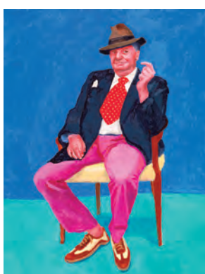
DAVID HOCKNEY: 82 PORTRAITS AND 1 STILL-LIFE Member Previews: April 13–14 Opening April 15 BCAM, Nathanson Gallery