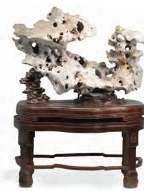
WU BIN: TEN VIEWS OF A LINGBI STONE Through June 24 Resnick Pavilion