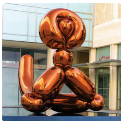
BALLOON MONKEY (ORANGE) Through January 6, 2019 L.A. Times Central Court