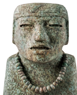
CITY AND COSMOS: THE ARTS OF TEOTIHUACAN Opens March 25 Member Previews: March 22–24 Resnick Pavilion