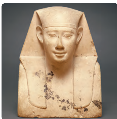
PASSING THROUGH THE UNDERWORLD: EGYPTIAN ART FROM THE LOS ANGELES COUNTY MUSEUM OF ART Opens March 17 Vincent Price Art Museum Monterey Park | 1301 Avenida Cesar Chavez