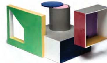
FOUND IN TRANSLATION: DESIGN IN CALIFORNIA AND MEXICO, 1915–1985 Through April 1 Resnick Pavilion