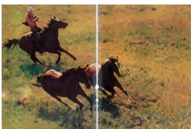
RICHARD PRINCE: UNTITLED (COWBOY) Through March 25 BCAM