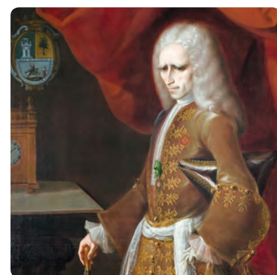
PAINTED IN MEXICO, 1700–1790: PINXIT MEXICI Through March 18 Resnick Pavilion