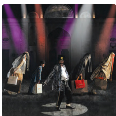
IN THE FIELDS OF EMPTY DAYS: THE INTERSECTION OF PAST AND PRESENT IN IRANIAN ART Member Previews: May 3–5 Opening May 6 BCAM