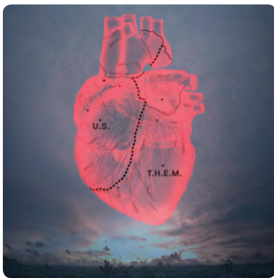
ALEJANDRO G. INÁRRITU: CARNE Y ARENA (VIRTUALLY PRESENT, PHYSICALLY INVISIBLE) Advance reservations required Through July 1 BCAM