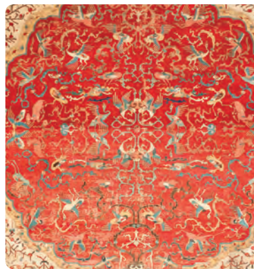
A TALE OF TWO PERSIAN CARPETS (ONE BY ONE): THE ARDABIL AND CORONATION CARPETS Through July 8 Resnick Pavilion