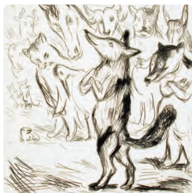
1917/1918: LOOKING BACKWARD, STEPPING FORWARD Through April 1 Ahmanson Building