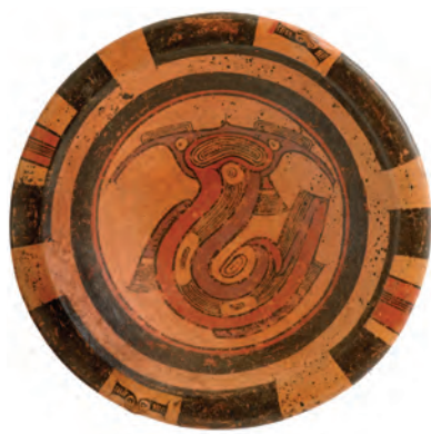
CREATURES OF THE EARTH, SEA, AND SKY: PAINTING THE PANAMANIAN COSMOS Through July 8 Ahmanson Building