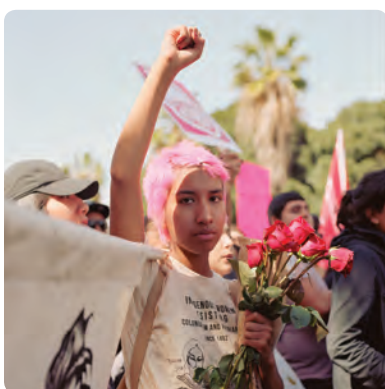
A UNIVERSAL HISTORY OF INFAMY: THOSE OF THIS AMERICA Through October 6 Charles White Elementary School MacArthur Park | 2401 Wilshire Blvd.