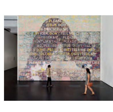
150 PORTRAIT TONE Ongoing Resnick Pavilion