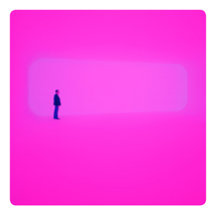
JAMES TURRELL, BREATHING LIGHT Through May 29 Resnick Pavilion