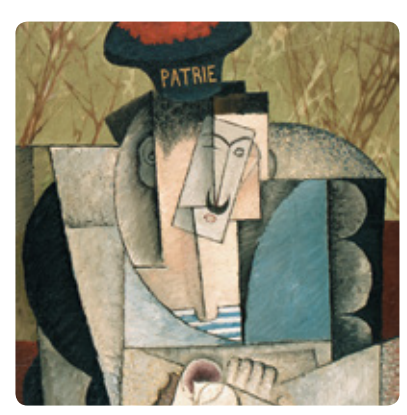
PICASSO & RIVERA: CONVERSATIONS ACROSS TIME Through May 7 BCAM