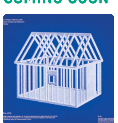
HOME-SO DIFFERENT, SO APPEALING Opening June 11 Member Previews: June 8-10