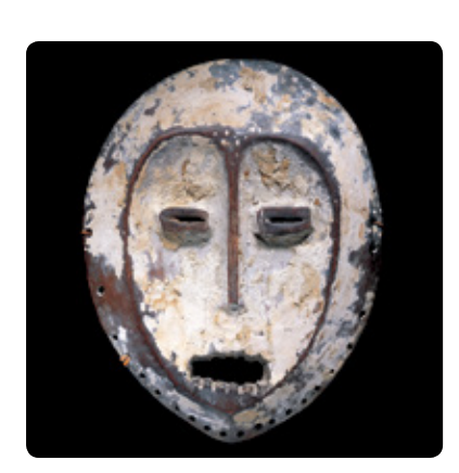
THE INNER EYE: VISION AND TRANSCENDENCE IN AFRICAN ARTS Through July 9 Resnick Pavilion