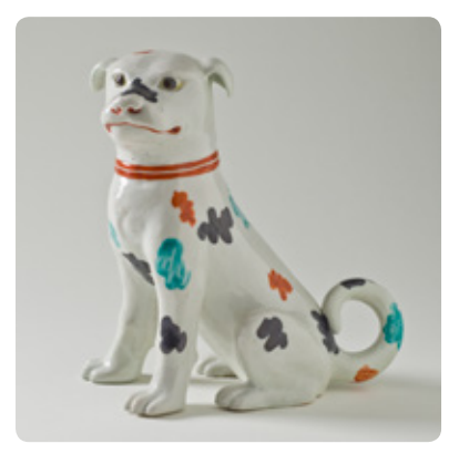
JAPANESE ART AT LACMA: CELEBRATING 10 YEARS OF THE JAPANESE ART ACQUISITIONS GROUP Through May 7