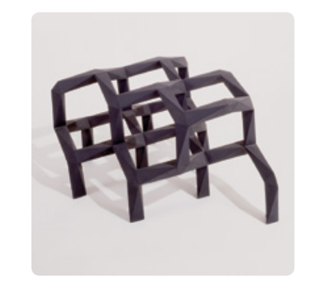
TONY SMITH: SMOKE Through July 2 Ahmanson Building