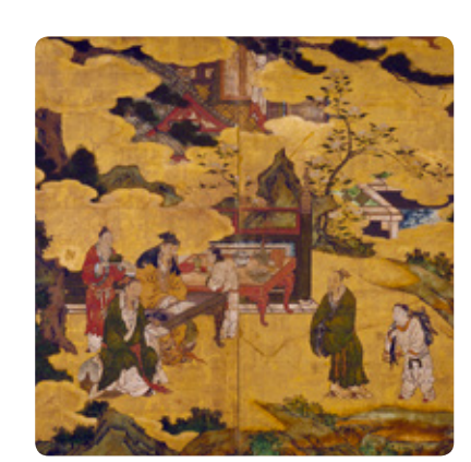
JAPANESE PAINTING: A WALK IN NATURE Opens May 13 Pavilion for Japanese Art