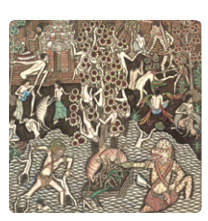
STORYTELLING IN BALI: PAINTINGS FROM THE BATESON-MEAD COLLECTION Through July 2 Ahmanson Building