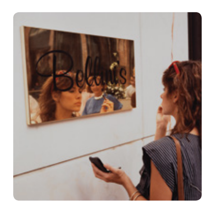
LABOR AND PHOTOGRAPHY Through June 11 Hammer Building