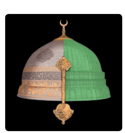
ABDULNASSER GHAREM: PAUSE Through July 2 Ahmanson Building