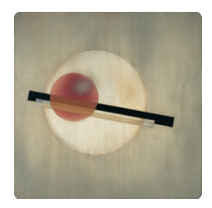
MOHOLY-NAGY: FUTURE PRESENT Through June 18 Art of the Americas Building