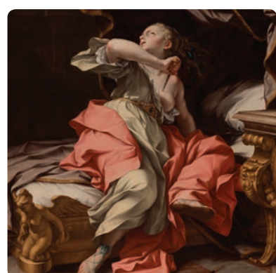
TO ROME AND BACK: INDIVIDUALISM AND AUTHORITY IN ART, 1500–1800 Member Previews: June 21–23 Opening June 24 Resnick Pavilion