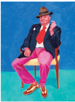
DAVID HOCKNEY: 82 PORTRAITS AND 1 STILL-LIFE Through July 29 BCAM, Nathanson Gallery