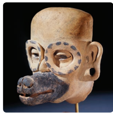
ANCIENT BODIES: TRANSFORMATION, PERSONHOOD AND POWER IN MESOAMERICA Through July 9 Art of the Americas