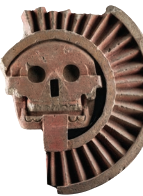
CITY AND COSMOS: THE ARTS OF TEOTIHUACAN Through July 15 Resnick Pavilion