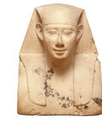
PASSING THROUGH THE UNDERWORLD: EGYPTIAN ART FROM THE LOS ANGELES COUNTY MUSEUM OF ART Through December 8 Vincent Price Art Museum Monterey Park | 1301 Avenida Cesar Chavez