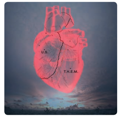
ALEJANDRO G. INÁRRITU: CARNE Y ARENA (VIRTUALLY PRESENT, PHYSICALLY INVISIBLE) Advance reservations required Through July 1 BCAM