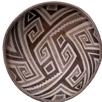
DECODING MIMBRES PAINTING: ANCIENT CERAMICS OF THE AMERICAN SOUTHWEST Opens May 20 Member Previews: May 17–19 Resnick Pavilion