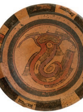
CREATURES OF THE EARTH, SEA, AND SKY: PAINTING THE PANAMANIAN COSMOS Through September 3 Ahmanson Building