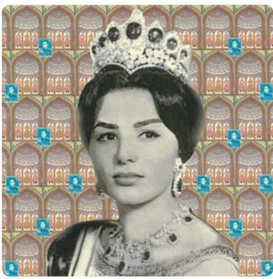
IN THE FIELDS OF EMPTY DAYS: THE INTERSECTION OF PAST AND PRESENT IN IRANIAN ART Opens May 6 Member Previews: May 3–5 BCAM