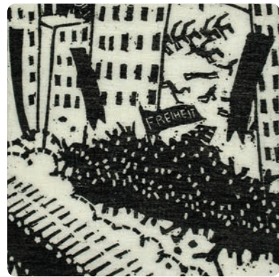
PICTURING THE MASSES: GERMANY, 1900–1938 Through August 26 Ahmanson Building