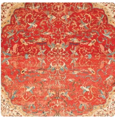
A TALE OF TWO PERSIAN CARPETS (ONE BY ONE): THE ARDABIL AND CORONATION CARPETS Through July 8 Resnick Pavilion