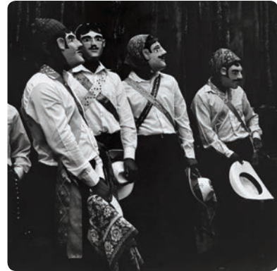
MARIANA YAMPOLSKY: PHOTOGRAPHS FROM THE LOS ANGELES COUNTY MUSEUM OF ART Through December 8 Vincent Price Art Museum Monterey Park | 1301 Avenida Cesar Chavez