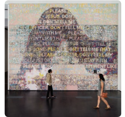
150 PORTRAIT TONE Ongoing Resnick Pavilion