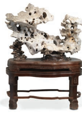
WU BIN: TEN VIEWS OF A LINGBI STONE Through June 24 Resnick Pavilion