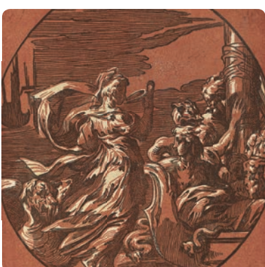
THE CHIAROSCURO WOODCUT IN RENAISSANCE ITALY Member Previews: May 31–June 2 Opening June 3 Resnick Pavilion