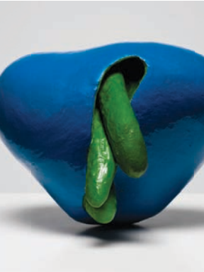
HIDDEN NARRATIVES: RECENT ACQUISITIONS OF POSTWAR ART Through January 6, 2019 Ahmanson Building