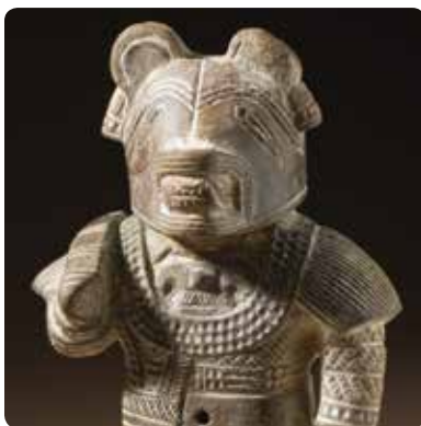
ANCIENT COLOMBIA: A JOURNEY THROUGH THE CAUCA VALLEY Through December 31 Art of the Americas Building