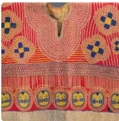
AFRICAN TEXTILES AND ADORNMENT: SELECTIONS FROM THE MARCEL AND ZAIRA MIS COLLECTION Through October 12 | Hammer Building