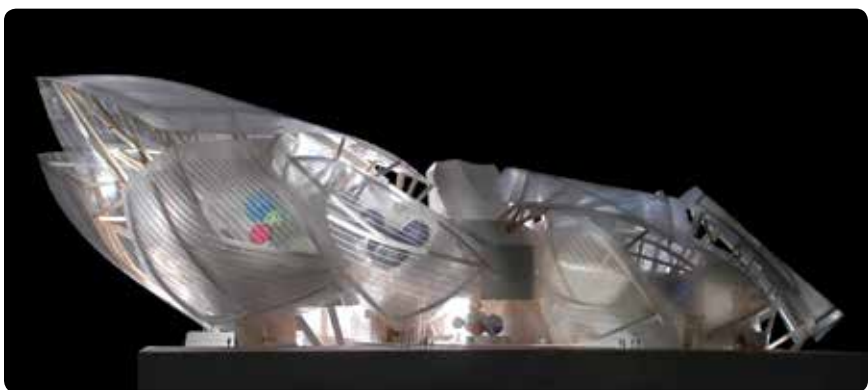
FRANK GEHRY Opening September 13 Member Previews: September 10-12 Resnick Pavilion

Frank Gehry presents a comprehensive examination of his extraordinary body of work from the early 1960s to the present, featuring over 200 drawings, many of which have never been seen publicly, and more than 65 models that illuminate the evolution of Gehry's thinking.