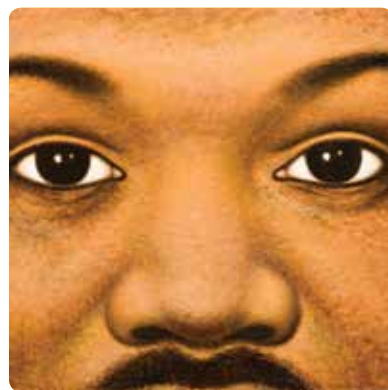
FACES OF AMERICA: LACMA COLLECTS Through November 8 Art of the Americas Building