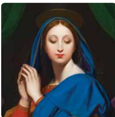
50 FOR 50: GIFTS ON THE OCCASION OF LACMA'S ANNIVERSARY Through September 13 | Resnick Pavilion