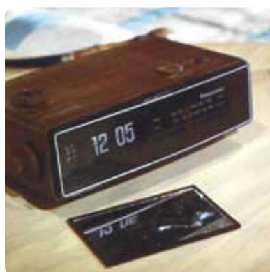
CHRISTIAN MARCLAY: THE CLOCK Through September 7 Art of the Americas Building