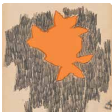
ED MOSES: DRAWINGS FROM THE 1960S AND 70S Through August 2 | BCAM