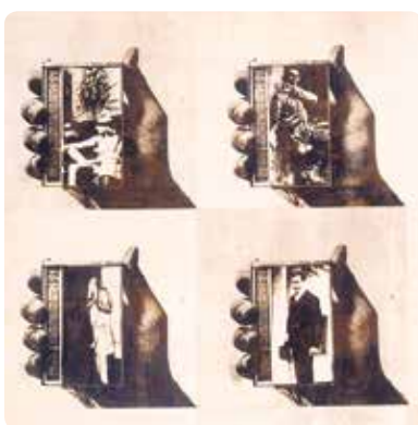
DRAWING IN L.A.: THE 1960S AND 70S Through August 2 | BCAM