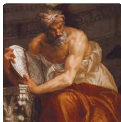
FOUR ALLEGORIES OF VERONESE: A REDISCOVERY AND A REUNION Through September 7 | Ahmanson Building