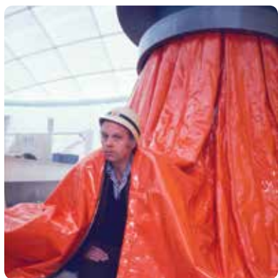
FROM THE ARCHIVES: ART AND TECHNOLOGY AT LACMA, 1967-1971 Through October 25 | Ahmanson Building