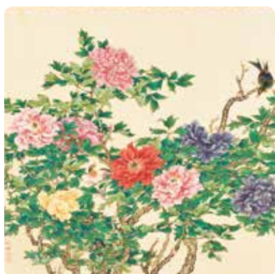
JAPANESE PAINTINGS AND PRINTS: CELEBRATING LACMA'S 50TH ANNIVERSARY Through September 20 Pavilion for Japanese Art