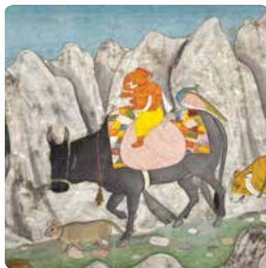
LANDSCAPES OF DEVOTION: VISUALIZING SACRED SITES IN INDIA Through October 25 | Ahmanson Building