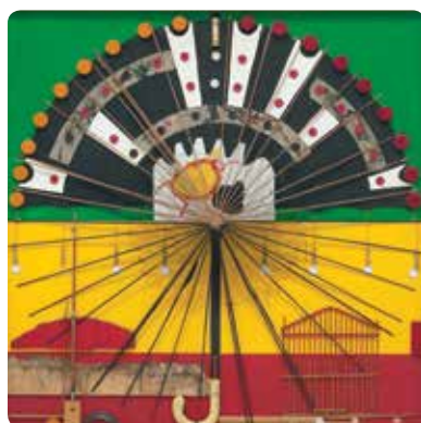
NOAH PURIFOY: JUNK DADA Through September 27 BCAM and BP Grand Entrance