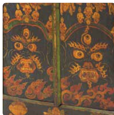
RITUAL OFFERINGS IN TIBETAN ART Through October 3 | Ahmanson Building