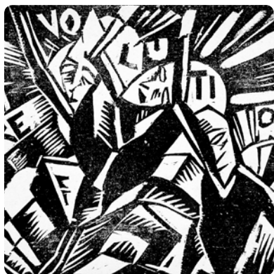
AKTION! ART AND REVOLUTION IN GERMANY, 1918-19 Through January 10, 2016 Ahmanson Building