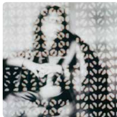
ISLAMIC ART NOW: CONTEMPORARY ART OF THE MIDDLE EAST Ongoing | Ahmanson Building