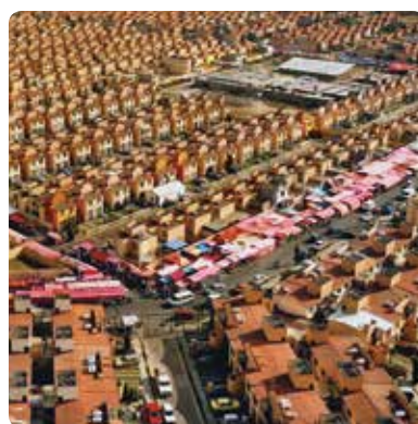
HOME—SO DIFFERENT, SO APPEALING Through October 15 BCAM