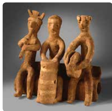
ANCIENT BODIES: ARCHAEOLOGICAL PERSPECTIVES ON MESOAMERICAN FIGURINES Through February 4 Art of the Americas Building