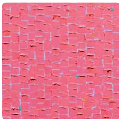
UNEXPECTED LIGHT: WORKS BY YOUNG-IL AHN Through January 21 Hammer Building