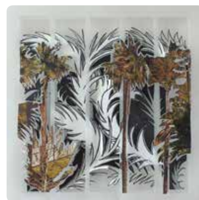
A UNIVERSAL HISTORY OF INFAMY Opens August 20 Member Previews: August 17–19 BCAM