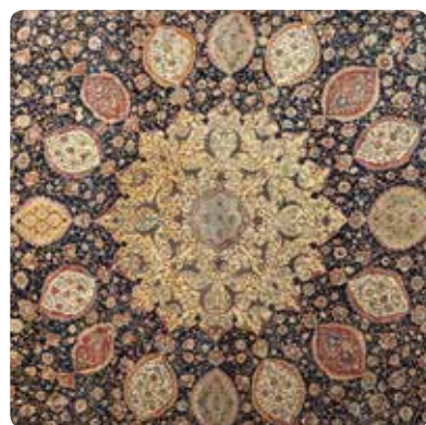
A TALE OF TWO PERSIAN CARPETS (ONE BY ONE): THE ARDABIL AND CORONATION CARPETS Opening September 17 Member Previews: September 14–16 Resnick Pavilion