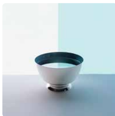
SARAH CHARLESWORTH: DOUBLEWORLD Opens August 20 Member Previews: August 17–19 Art of the Americas Building