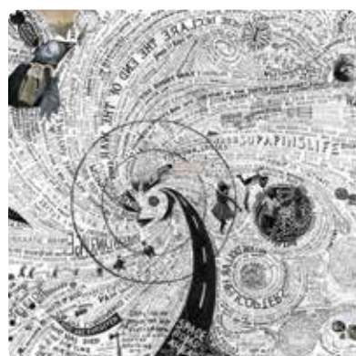
ON THE MOVE: A CENTURY OF CROSSING BORDERS Opens August 19 Ahmanson Building