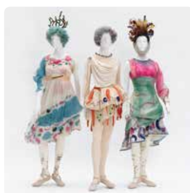
CHAGALL: FANTASIES FOR THE STAGE Through January 7 Resnick Pavilion