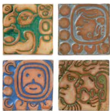
FOUND IN TRANSLATION: DESIGN IN CALIFORNIA AND MEXICO, 1915–1985 Opening September 17 Member Previews: September 14–16 Resnick Pavilion