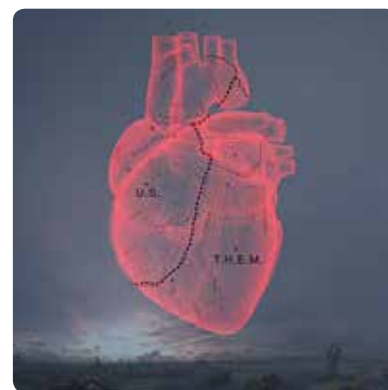
ALEJANDRO G. INÁRRITU: CARNE Y ARENA (VIRTUALLY PRESENT, PHYSICALLY INVISIBLE) Ongoing BCAM