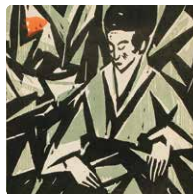
FORM IN FRAGMENTS: ABSTRACTION IN GERMAN ART, 1906–1925 Through October 22 Ahmanson Building