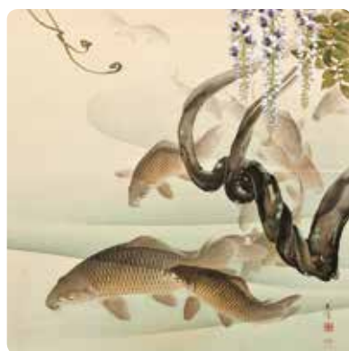
JAPANESE PAINTING: A WALK IN NATURE Through September 10 Pavilion for Japanese Art