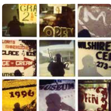
ED FELLA: FREE WORK IN DUE TIME Through October 29 Art of the Americas Building