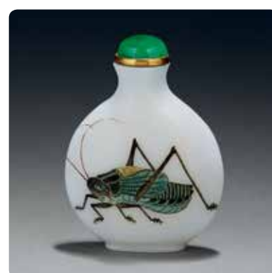
CHINESE SNUFF BOTTLES FROM SOUTHERN CALIFORNIAN COLLECTORS Through January 21 Hammer Building