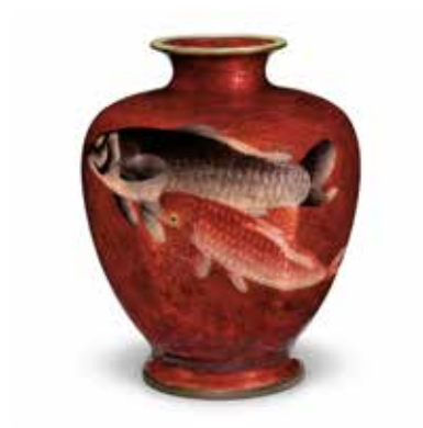
POLISHED TO PERFECTION: JAPANESE CLOISONNÉ FROM THE COLLECTION OF DONALD K. GERBER AND SUEANN E. SHERRY Through February 4 Pavilion for Japanese Art