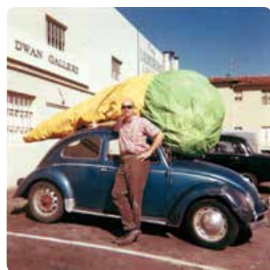
LOS ANGELES TO NEW YORK: DWAN GALLERY, 1959–1971 Through September 10 Resnick Pavilion