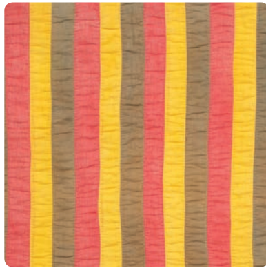
BIG QUILTS IN SMALL SIZES: CHILDREN'S HISTORICAL BEDCOVERS Through January 4, 2015 Art of the Americas Building