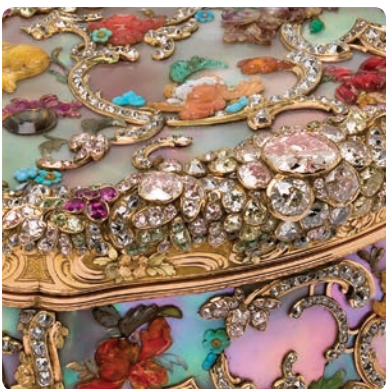
CLOSE-UP AND PERSONAL: 18TH-CENTURY GOLD BOXES FROM THE ROSALINDE AND ARTHUR GILBERT COLLECTION Through March 1, 2015 Hammer Building