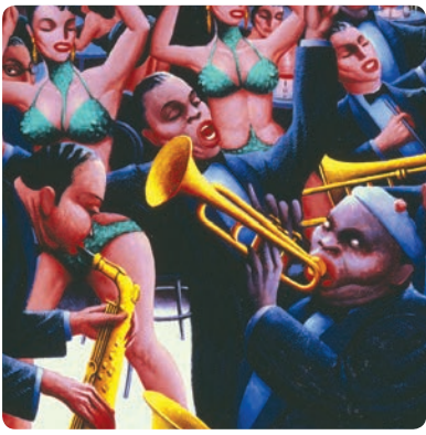
ARCHIBALD MOTLEY: JAZZ AGE MODERNIST October 19–February 1, 2015 | BCAM Member Previews: October 16–18