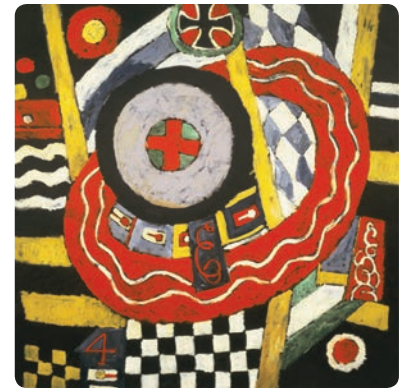
MARSDEN HARTLEY: THE GERMAN PAINTINGS 1913-1915 Through November 30 BCAM