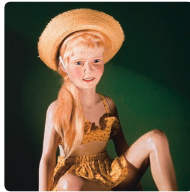
PLAYTHINGS: THE UNCANNY ART OF MORTON BARTLETT Through January 31, 2015 Hammer Building