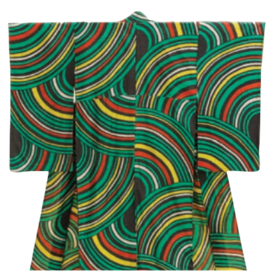
KIMONO FOR A MODERN AGE Through October 19 Pavilion for Japanese Art