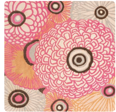
ART DECO TEXTILES Through February 15, 2015 Ahmanson Building