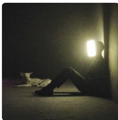
PIERRE HUYGHE Opens November 23 Through February 22, 2015 Member Previews: November 20–22