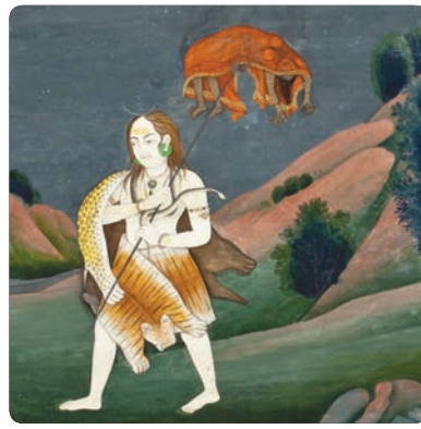
LANDSCAPES OF DEVOTION: VISUALIZING SACRED SITES OF INDIA October 25–ongoing | Ahmanson Building