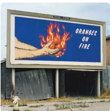
LARRY SULTAN: HERE AND HOME Opens November 9 Through March 22, 2015 Member Previews: November 6–8