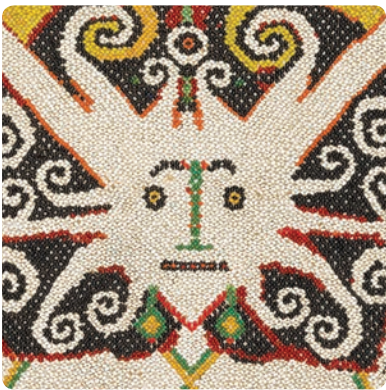
FRAGMENTARY TALES: SELECTIONS FROM THE LLOYD COTSEN "TEXTILE TRACES" COLLECTION Through October 26 | Ahmanson Building