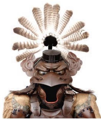
SAMURAI: JAPANESE ARMOR October 19–February 1, 2015 Resnick Pavilion Member Preview: October 16–18