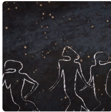
AFRICAN COSMOS: STELLAR ARTS Through November 30 Hammer Building