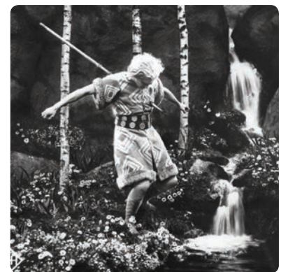
HAUNTED SCREENS: GERMAN CINEMA IN THE 1920S Through April 26, 2015 Art of the Americas Building