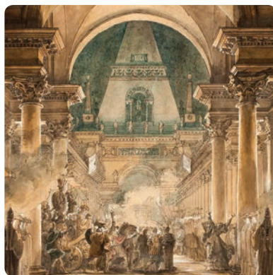
A TASTE FOR THE ANTIQUE: NEO-CLASSICAL DRAWINGS FROM THE PERMANENT COLLECTION Through March 8, 2015 Ahmanson Building