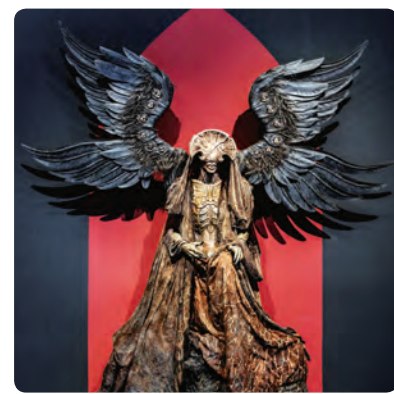
GUILLERMO DEL TORO: AT HOME WITH MONSTERS Through November 27 Art of the Americas Building