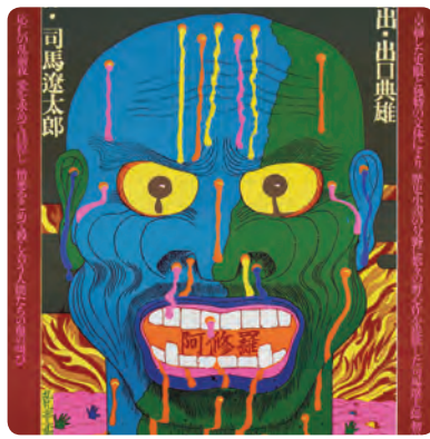
AWAZU KIYOSHI, GRAPHIC DESIGN: SUMMONING THE OUTDATED Opens October 15 Pavilion for Japanese Art