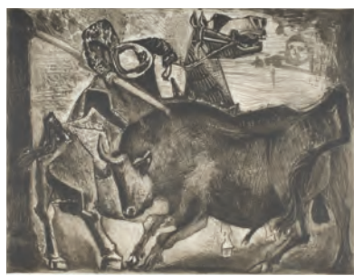
PICASSO AND HIS PRINTERS Through November 27 Ahmanson Building