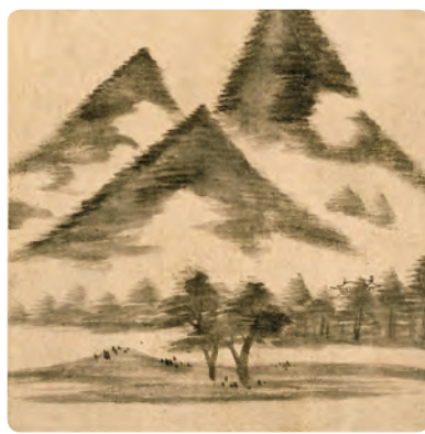
ALTERNATIVE DREAMS: 17TH-CENTURY CHINESE PAINTINGS FROM THE TSAO FAMILY COLLECTION Through December 4 Resnick Pavilion