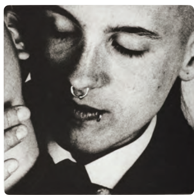
CATHERINE OPIE: O Through October 2 Hammer Building