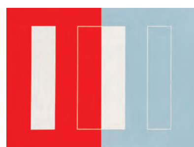
JOHN MCLAUGHLIN PAINTINGS: TOTAL ABSTRACTION Opening November 13 Member Previews: November 10–12 BCAM