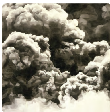
TOHA KHEDOORI Through March 19, 2017 BCAM