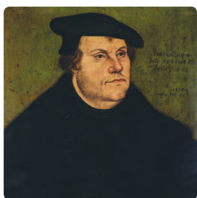
RENAISSANCE AND REFORMATION: GERMAN ART IN THE AGE OF DÜRER AND CRANACH Opening November 20 Member Previews: November 17–19 Resnick Pavilion