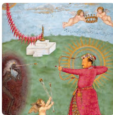
THE ENIGMATIC IMAGE: CURIOUS SUBJECTS IN INDIAN ART Through October 16 Ahmanson Building