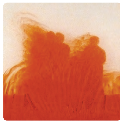
SENSES OF TIME: VIDEO AND FILM-BASED WORKS OF AFRICA Through January 2, 2017 Hammer Building