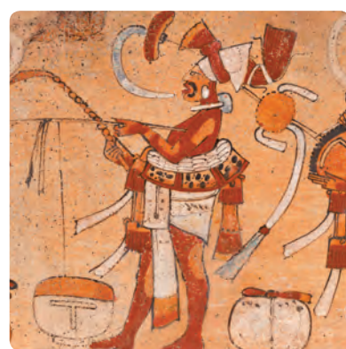
REVEALING CREATION: THE SCIENCE AND ART OF ANCIENT MAYA CERAMICS Ongoing Art of the Americas Building