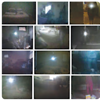
TV ON FILM Opens October 8 Hammer Building