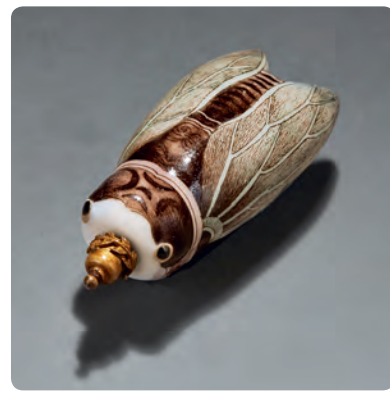
CHINESE SNUFF BOTTLES FROM SOUTHERN CALIFORNIA COLLECTORS Opens October 29 Hammer Building