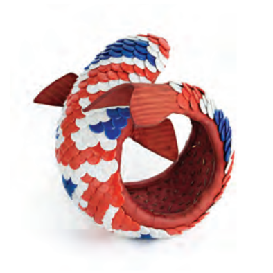
BEYOND BLING: JEWELRY FROM THE LOIS BOARDMAN COLLECTION Opens October 2 Member Preview: October 1 Ahmanson Building