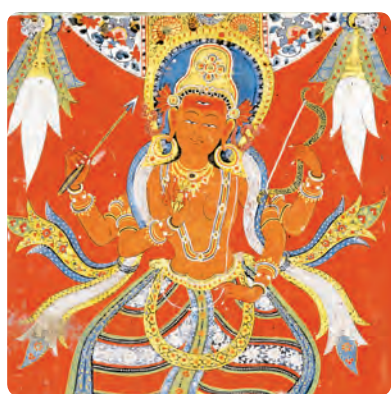
DEVI: THE IMAGE OF THE GODDESS IN NEPAL Through January 29, 2017 Ahmanson Building