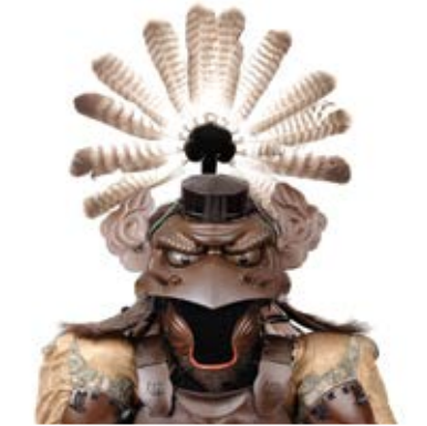
SAMURAI: JAPANESE ARMOR FROM THE BARBIER-MUELLER COLLECTION Through February 1, 2015 Resnick Pavilion