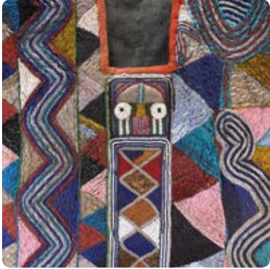
AFRICAN COSMOS: STELLAR ARTS Through November 30 Hammer Building