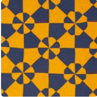
BIG QUILTS IN SMALL SIZES: CHILDREN'S HISTORICAL BEDCOVERS Through January 4, 2015 Art of the Americas Building