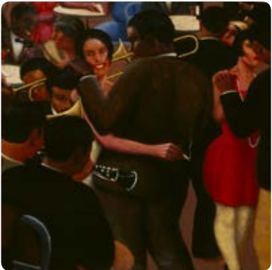
ARCHIBALD MOTLEY: JAZZ AGE MODERNIST Through February 1, 2015 | BCAM