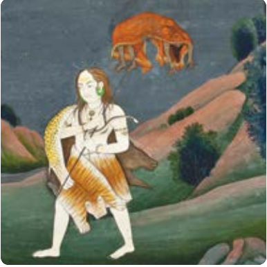
LANDSCAPES OF DEVOTION: VISUALIZING SACRED SITES OF INDIA Ongoing | Ahmanson Building