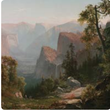
NATURE AND THE AMERICAN VISION: THE HUDSON RIVER SCHOOL Opens December 7 Through June 7, 2015 Member Previews: December 4–6