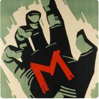
HAUNTED SCREENS: GERMAN CINEMA IN THE 1920S Through April 26, 2015 Art of the Americas Building