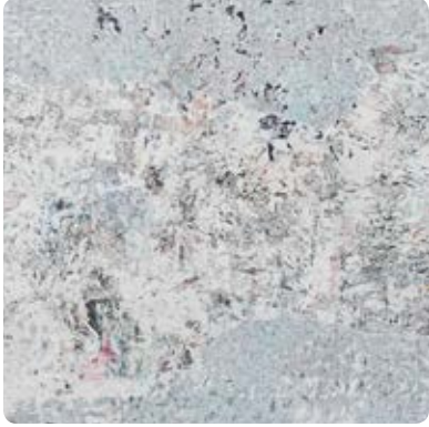
VARIATIONS: CONVERSATIONS IN AND AROUND ABSTRACT PAINTING Through March 22, 2015 BCAM