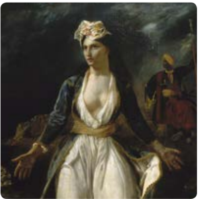
GREECE ON THE RUINS OF MISSOLONGHI November 16, 2014–February 15, 2015 Member Preview: Nov. 15 Ahmanson Building