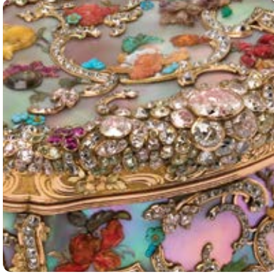
CLOSE-UP AND PERSONAL: 18TH-CENTURY GOLD BOXES FROM THE ROSALINDE AND ARTHUR GILBERT COLLECTION Through March 1, 2015 Hammer Building