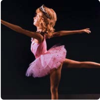
PLAYTHINGS: THE UNCANNY ART OF MORTON BARTLETT Through January 31, 2015 Hammer Building