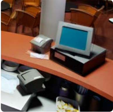
THOMAS DEMAND: PACIFIC SUN Opens December 13 Through April 12, 2015