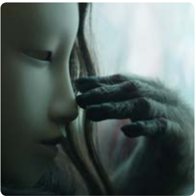
PIERRE HUYGHE November 23, 2014–February 22, 2015 Member Previews: November 20–22 Resnick Pavilion