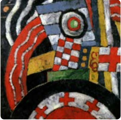
MARSDEN HARTLEY: THE GERMAN PAINTINGS 1913–1915 Through November 30 | BCAM