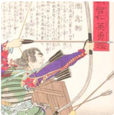
ART OF THE SAMURAI: SWORDS, PAINTINGS, PRINTS AND TEXTILES November 1, 2014–March 1, 2015 Pavilion for Japanese Art