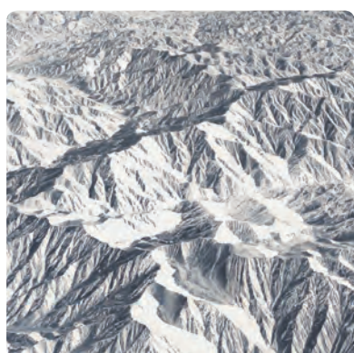
TOBA KHEDOORI Through March 19, 2017 BCAM