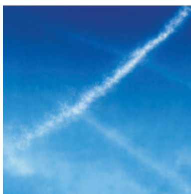
L.A. EXUBERANCE: NEW GIFTS BY ARTISTS Through April 2, 2017 BCAM