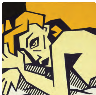
THE SERIAL IMPULSE AT GEMINI G.E.L. Through January 2, 2017 Resnick Pavilion