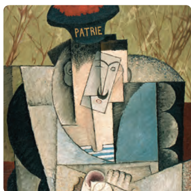
PICASSO & RIVERA: CONVERSATIONS ACROSS TIME Opens December 4 Member Previews: December 1–3 BCAM