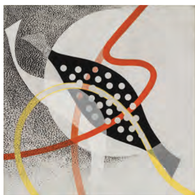
MOHOLY-NAGY: FUTURE PRESENT Opening February 12, 2017 Member Previews: February 9–11, 2017 Art of the Americas Building