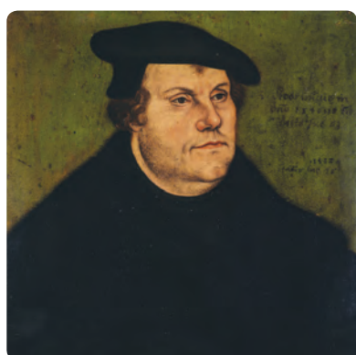
RENAISSANCE AND REFORMATION: GERMAN ART IN THE AGE OF DÜRER AND CRANACH Through March 26, 2017 Resnick Pavilion