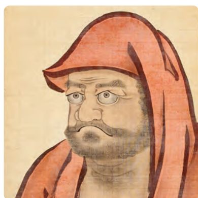
JAPANESE PAINTING: FROM THE ZEN MIND Through December 18 Pavilion for Japanese Art