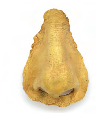
BEYOND BLING: JEWELRY FROM THE LOIS BOARDMAN COLLECTION Through February 5, 2017 Ahmanson Building