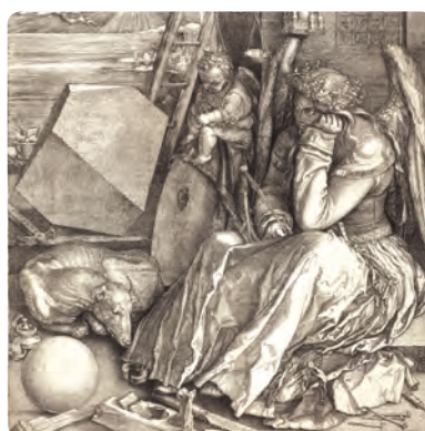
THE PRINTS OF ALBRECHT DÜRER: MASTERWORKS FROM THE COLLECTION Opens December 17 Ahmanson Building