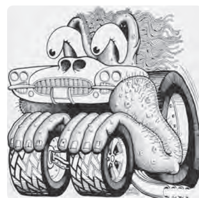
CARTOONS: ART OF AMERICA'S CAR CULTURE Through January 2, 2017 Art of the Americas Building