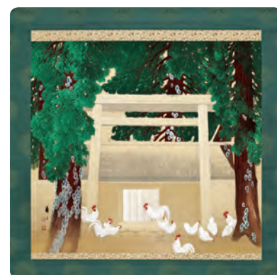
JAPANESE ART AT LACMA: CELEBRATING 10 YEARS OF THE JAPANESE ART ACQUISITIONS GROUP Opens December 24 Pavilion for Japanese Art