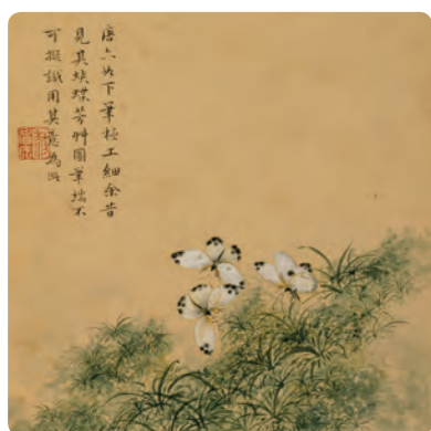
ALTERNATIVE DREAMS: 17TH-CENTURY CHINESE PAINTINGS FROM THE TSAO FAMILY COLLECTION Through December 4 Resnick Pavilion