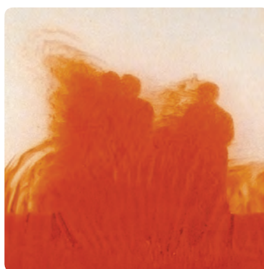
SENSES OF TIME: VIDEO AND FILM-BASED WORKS OF AFRICA Through January 2, 2017 Hammer Building