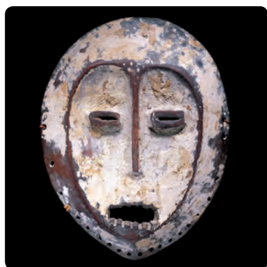
THE INNER EYE: VISION AND TRANSCENDENCE IN AFRICAN ARTS Opening February 26, 2017 Member Previews: February 23–25, 2017 Resnick Pavilion