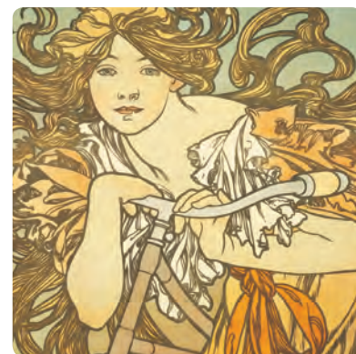
APOSTLES OF NATURE: JUGENDSTIL AND ART NOUVEAU Through March 12, 2017 Ahmanson Building