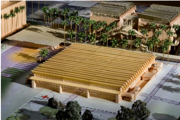
Model, northern aerial view Lynda and Stewart Resnick Exhibition Pavilion Renzo Piano Building Workshop, architects