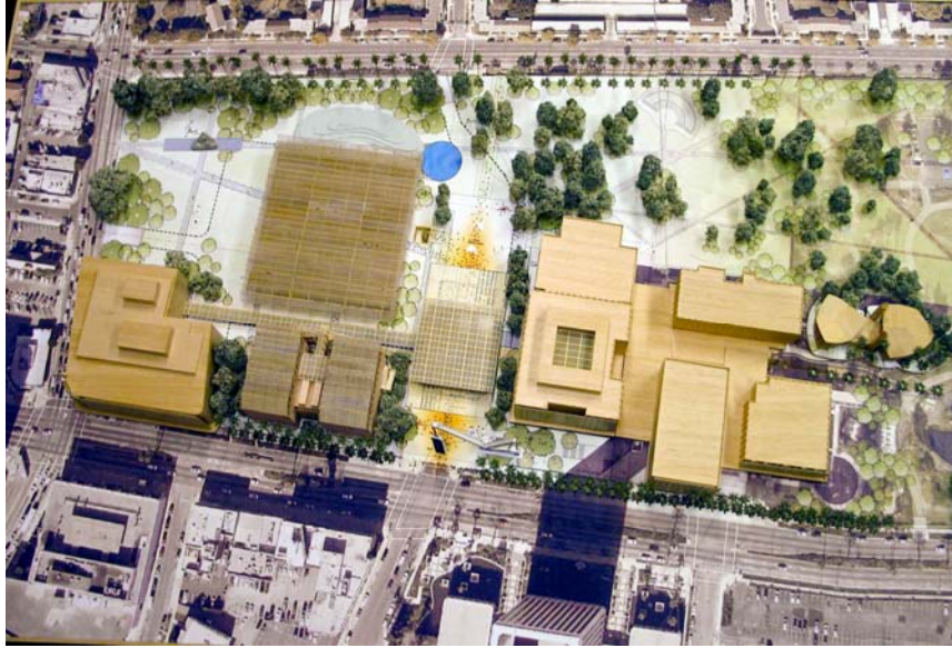
Model, LACMA campus overview Renzo Piano Building Workshop, architects