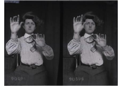
3-D: Double Vision