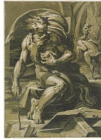
The Chiaroscuro Woodcut in Renaissance Italy