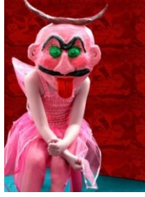
In the Fields of Empty Days: The Intersection of Past and Present in Iranian Art