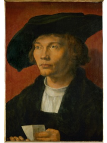
Renaissance and Reformation: German Art in the Age of Dürer and Cranach