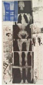
The Serial Impulse at Gemini G.E.L.

Current as of November 2016. Information is subject to change. For a listing of all exhibitions and installations, please visit www.lacma.org