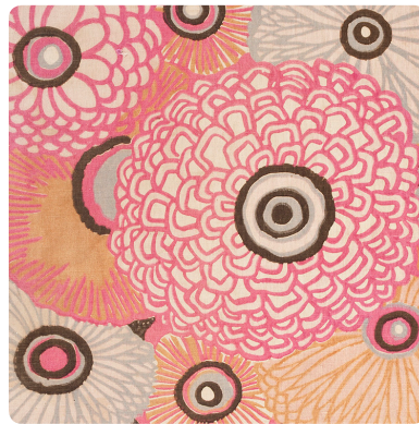
ART DECO TEXTILES July 26–November 30