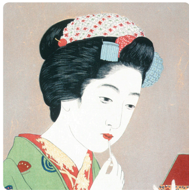
ZUAN: JAPANESE DESIGN BOOKS July 5–October 12