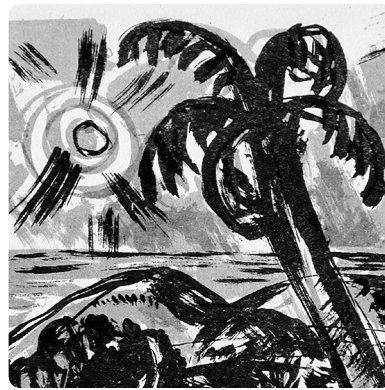
VISIONS OF THE SOUTH Through July 13