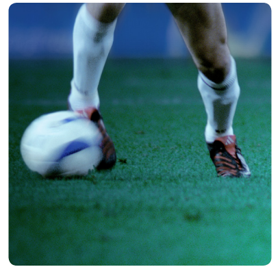
FÚTBOL: THE BEAUTIFUL GAME Through July 20