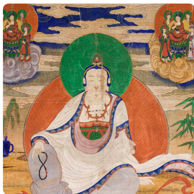
TREASURES FROM KOREA: ARTS AND CULTURE OF THE JOSEON DYNASTY, 1392–1910 Through September 28