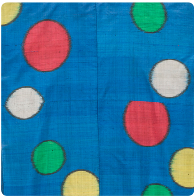
KIMONO FOR A MODERN AGE July 5–October 19