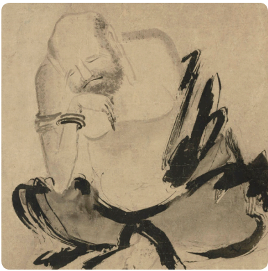
CHINESE PAINTINGS FROM JAPANESE COLLECTIONS Through July 6