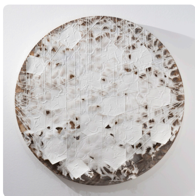
VARIATIONS: CONVERSATIONS IN AND AROUND ABSTRACT PAINTING Opens August 24 Through March 22, 2015 Member Previews: August 21–23