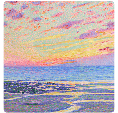
EXPRESSIONISM IN GERMANY AND FRANCE: FROM VAN GOGH TO KANDINSKY Through September 14