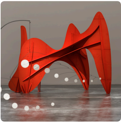
CALDER AND ABSTRACTION: FROM AVANT-GARDE TO ICONIC Through July 27