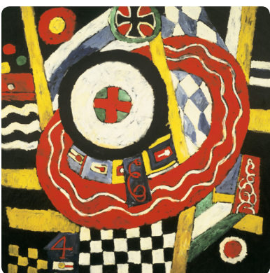
MARSDEN HARTLEY: THE GERMAN PAINTINGS 1913–1915 Opens August 3 Through November 30 Member Previews: July 31 and August 1–2