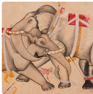
PRINCELY TRADITIONS AND COLONIAL PURSUITS IN INDIA Through October 12