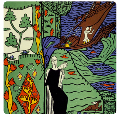
THE WRITTEN IMAGE: BOOKS AND PORTFOLIOS FROM THE RIFKIND CENTER July 26, 2014–January 18, 2015