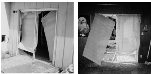
Left to right: John Divola, Faded Entry, Site 43, Interior View A; Faded Entry, Site 43, Exterior View A , 1975. Gelatin silver prints, printed 1982.

For Divola, these remnants were akin to the photographic process. Like the graffiti in the house, negatives are the result of light marking an empty emulsion. Furthermore, photography, like vandalism, implies both a maker ("the photographer") and an action ("to photograph"), and yet the photograph itself is merely a vestige of that causal relationship. Armed with this analogy, Divola began to make his own spontaneous marks in the space and to explore the results photographically. The resulting images challenge basic assumptions about photographic imagery.