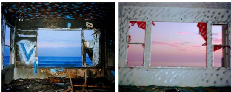
Left to right: John Divola, Zuma #25, Zuma #23, 1977. Pigment print on rag paper.

On view: Selections from the Zuma series, representing 15 works