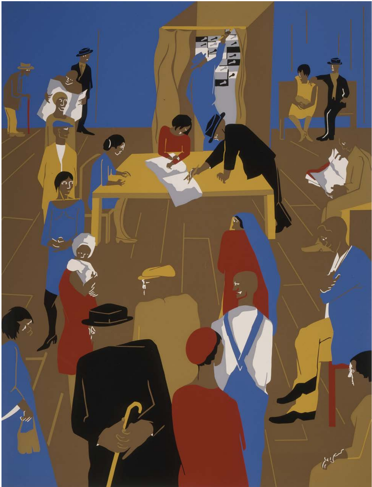
The 1920's...The Migrants Arrive and Cast Their Ballots, 1974