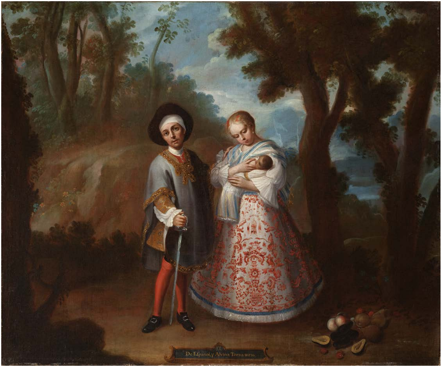
IX. From Spaniard and Albino, Return Backwards (IX. De español y albina, torna atrás), c. 1760