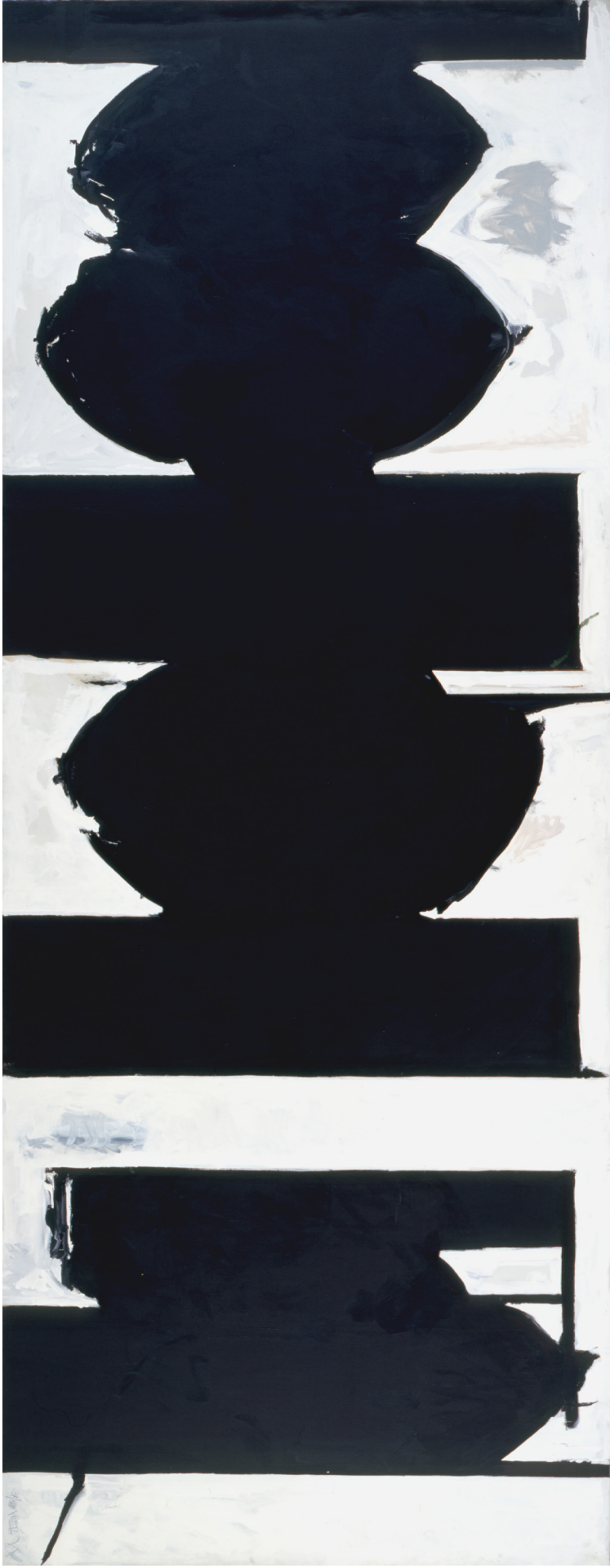
Elegy to the Spanish Republic 100 , 1963–75