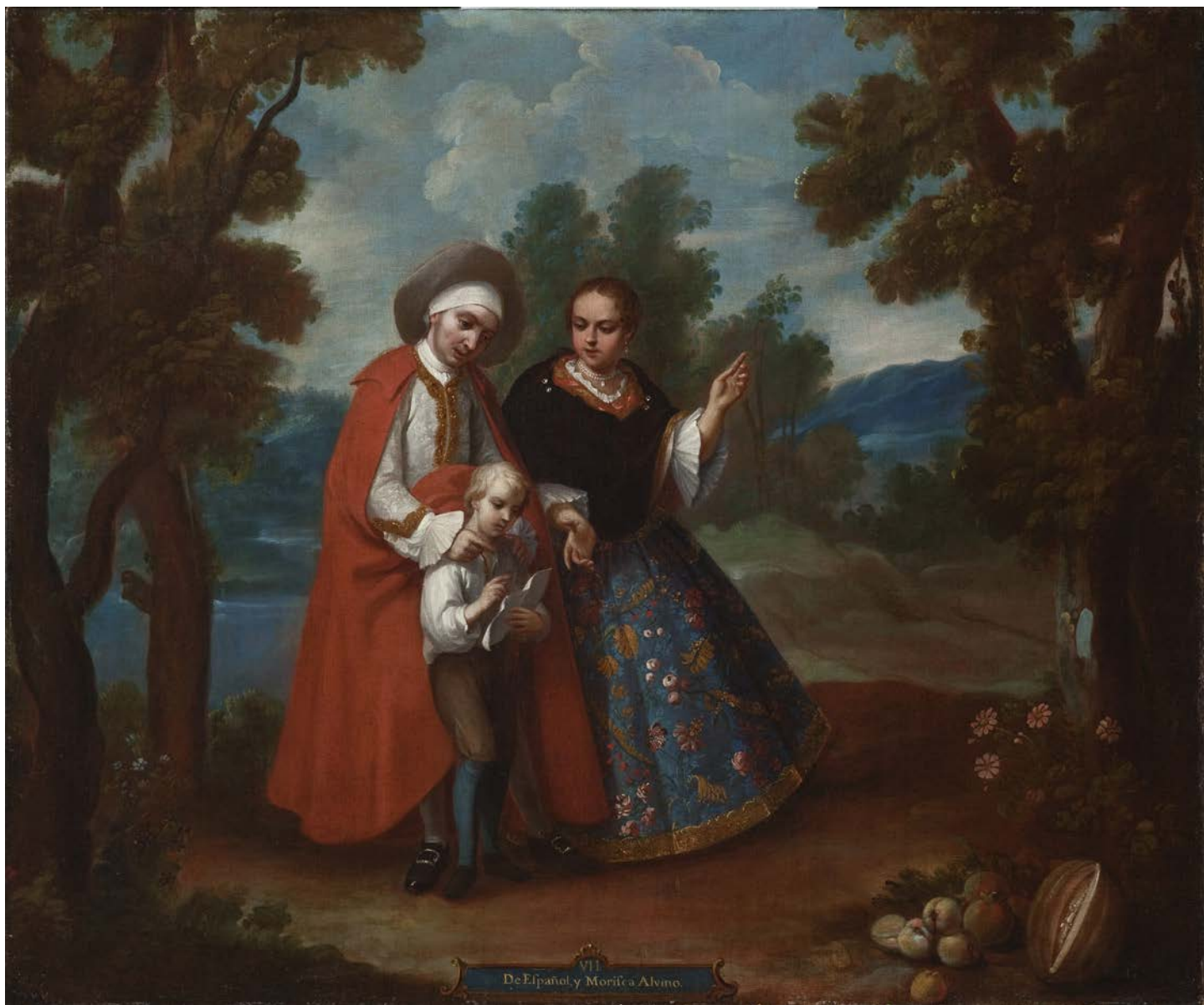
VII. From Spaniard and Morsica, Albino (VII. De español y morisca, albino ), c. 1760