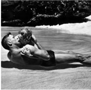
TUESDAY MATINEE: FROM HERE TO ETERNITY