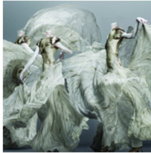
ALEXANDER MCQUEEN: SAVAGE BEAUTY