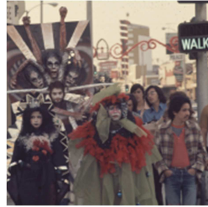
ASCO MURAL TOUR