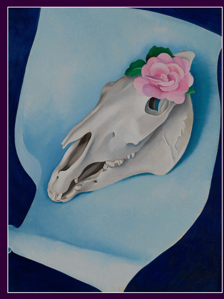
Georgia O'Keeffe, Horse's Skull with Pink Rose, 1931, Los Angeles County Museum of Art, gift of the Georgia O'Keeffe Foundation

Focus on the horse's skull and the flower. What details do you notice?