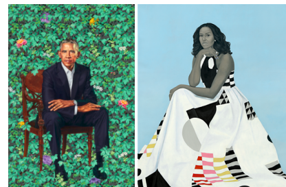
The Obama Portraits Tour