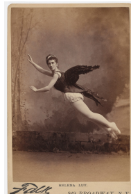
Acting Out: Cabinet Cards and the Making of Modern Photography, 1870–1900