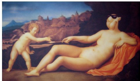
Legacies of Exchange: Chinese Contemporary Art from the Yuz Foundation

Current as of July 2021. Information is subject to change. For a listing of all exhibitions and installations, please visit www.lacma.org