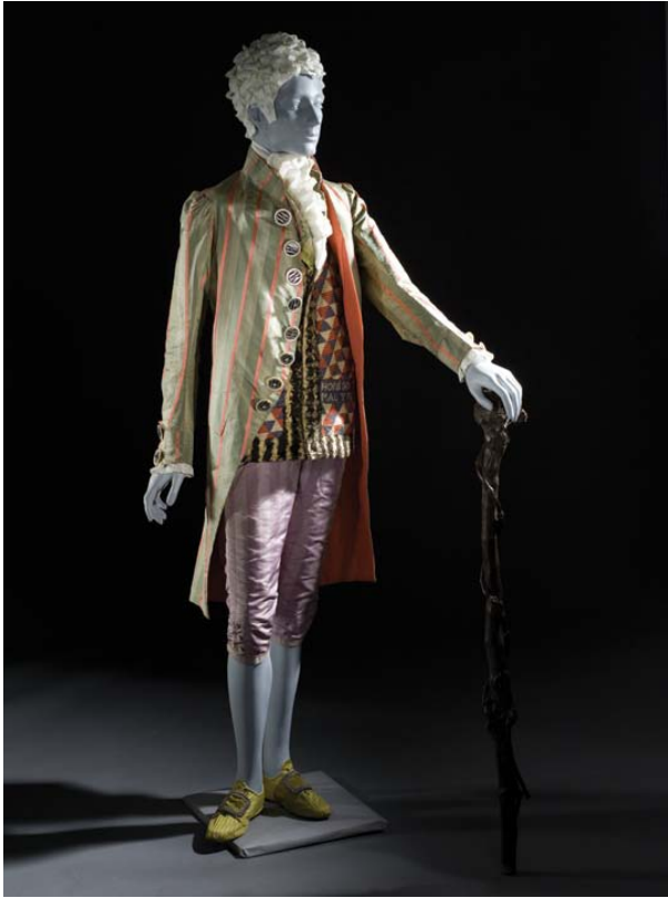
Man's Suite, France, c. 1790-1800