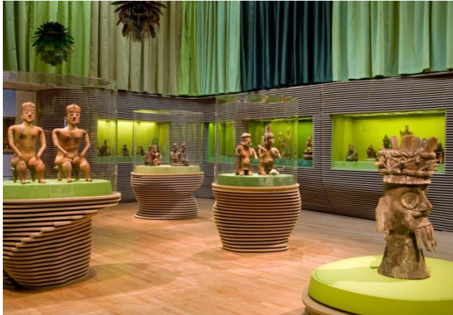
Installation of ancient American galleries

Overall expenditures grew from $87.8 million in FY2007 to $111 million in FY2013, an increase of more than 26 percent, or an average annual growth rate of 4 percent per year.