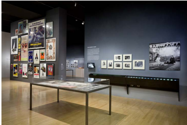
Stanley Kubrick Installation view, 2012

These estimates are conservative. In comparison, the estimates used by the Los Angeles Convention Center and Visitors Bureau for international visitors are at least four times as high, and those for domestic non-California visitors are five times that shown in the exhibit.