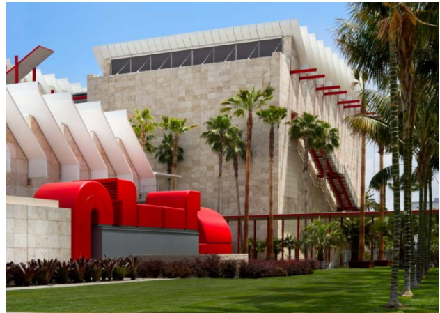
Lynda and Stewart Resnick Exhibition Pavilion (foreground) and Broad Contemporary Art Museum (background)

It is estimated that Phases 1 and 2 of the Transformation generated economic output in Los Angeles County of more than $477 million, and supported 3,650 jobs with a labor income of $230.2 million during its nine-year campaign. Moreover, this economic activity is estimated to have generated almost $22 million state and local taxes and $41.7 million in federal taxes.