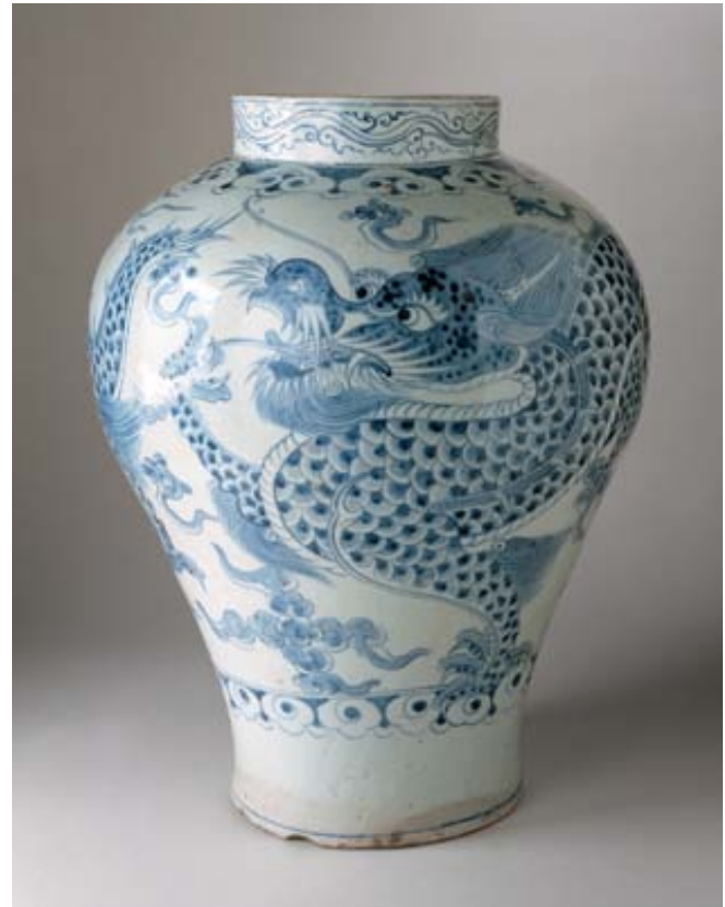
Jar with Dragon and Clouds, Korea, probably Kwangju, South Cholla Province, Joseon dynasty (1392-1910), 18 th century Purchased with Museum Funds

Moreover, the increase in foreign and non-local visitors has changed the economic impact of the Museum, since spending patterns of the three categories of visitors vary. For example, local visitors are not likely to spend the night in nearby lodging, and are less likely to rent a car. Many, including school children or repeat local visitors, will not purchase items in the museum gift shop or food and beverages in the restaurants. The composition of spending of non-local domestic and international visitors differs as well, but visitors in both of these categories will allocate their spending to hotels and accommodations, restaurants and drinking establishments, retail purchases and transportation. International visitors are known to spend more per