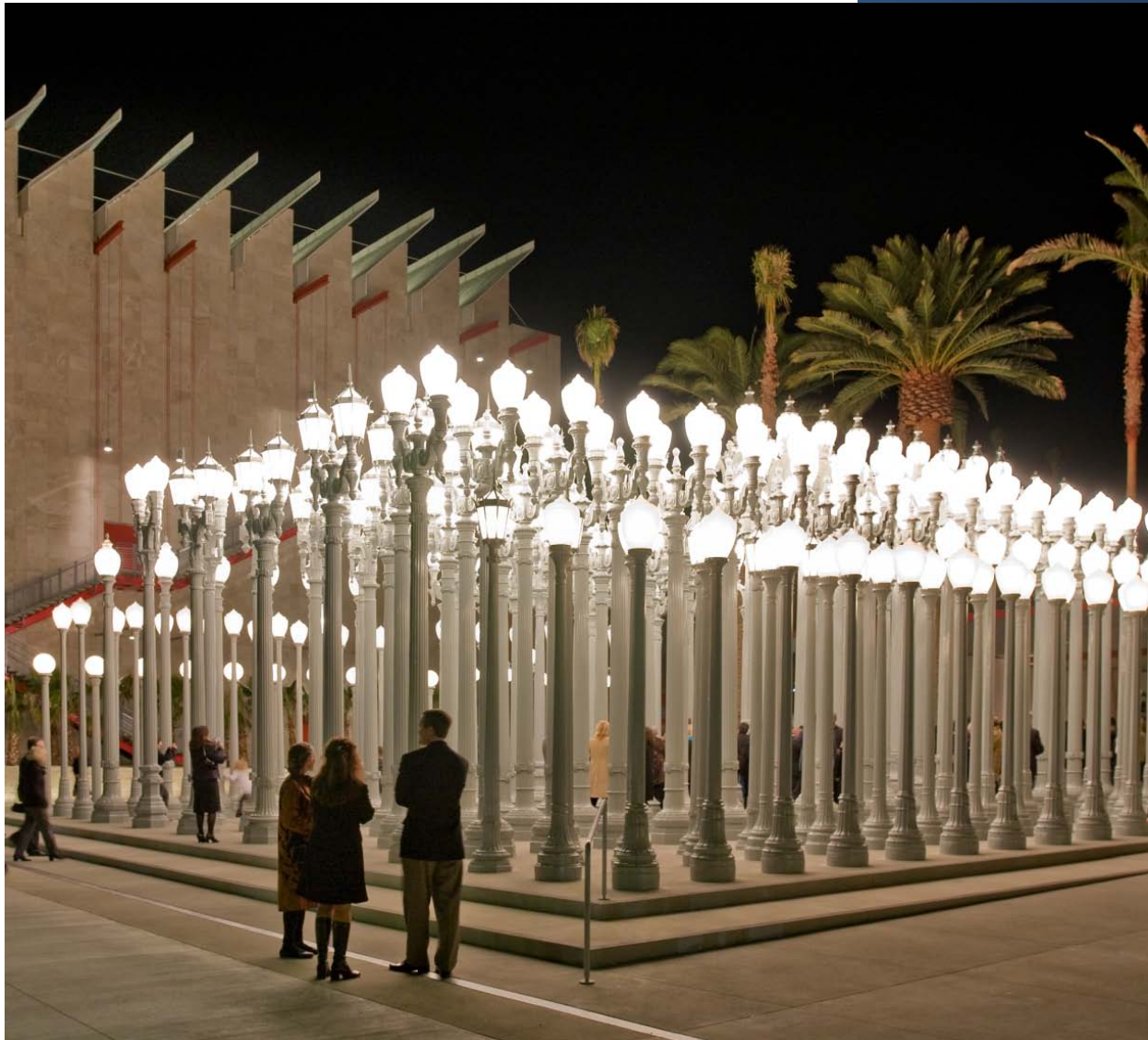
Chris Burden, Urban Light, 2008 The Gordon Family Foundation's gift to Transformation: The LACMA Campaign