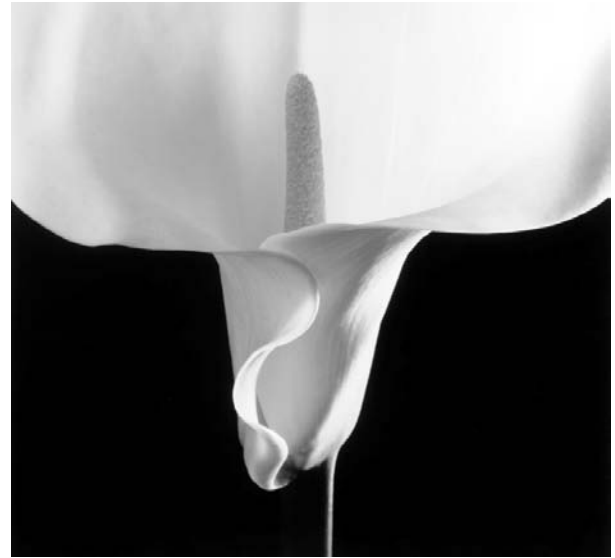
Robert Mapplethorpe, Calla Lily, 1988 Jointly acquired by LACMA and The J. Paul Getty Trust Partial gift of the Robert Mapplethorpe Foundation Partial purchase with funds from The David Geffen Foundation and The J. Paul Getty Trust

As it grows in both size and prominence, providing visitors with exciting cultural products and experiences, LACMA will also grow as a magnet for national and international tourists to Los Angeles, encouraging their stay and resulting in a rise in visitor spending directly attributable to the Museum. ❖