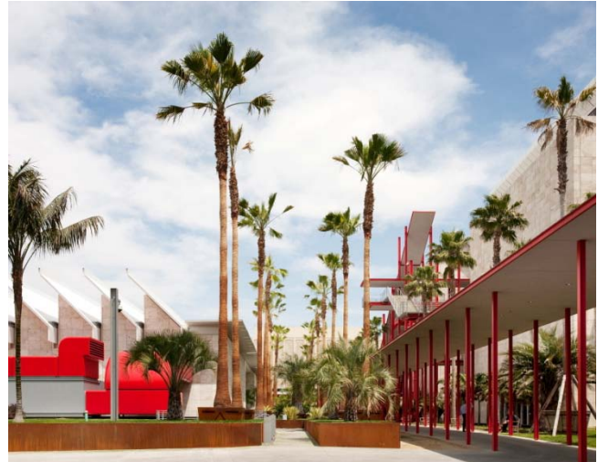
Robert Irwin Palm Garden at LACMA

The sizeable investment in the Transformation has brought significant benefits to Los Angeles County and its residents. These benefits extended beyond the