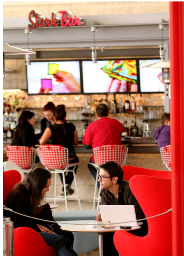
Stark Bar

The values in the exhibit should be interpreted as illustrative rather than precise given model and data limitations. A description of the industry sectors is provided in the Appendix.