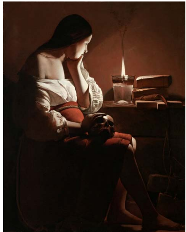
Georges de la Tour, The Magdalen with the Smoking Flame , c. 1638-1640 Gift of the Ahmanson Foundation

From LACMA's perspective, the Transformation resulted in incremental annual activity of $44.1 million. Thus the investment will pay for itself over 6 years of post- Transformation operations. ❖