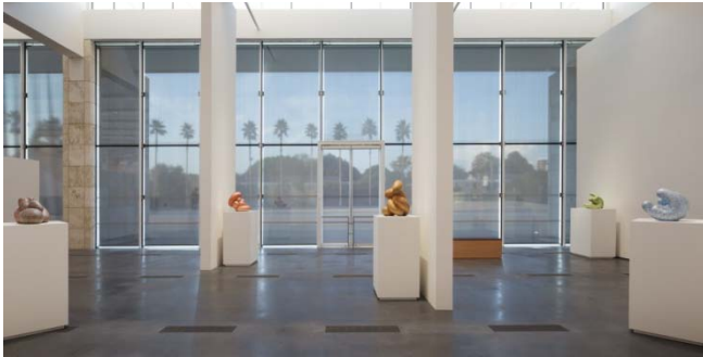
Ken Price Sculpture: A Retrospective, installation view, 2012 © Ken Price

Of the jobs generated, 2,340 were directly involved in the construction activity, and 1,310 were indirect and induced jobs supported by the suppliers and household spending of direct and indirect employees.