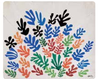
HENRI MATISSE: LA GERBE Opens April 21 | Through September 8 Member preview: April 20