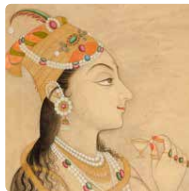
UNVEILING FEMININITY IN INDIAN PAINTING AND PHOTOGRAPHY Through July 28