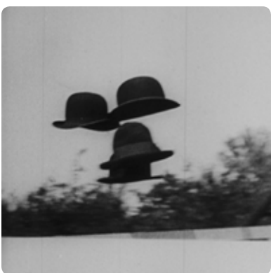
HANS RICHTER: ENCOUNTERS May 5–September 2 Member previews: May 2–4