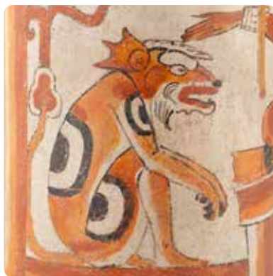
THE ANCIENT MAYA WORLD: MASTERWORKS FROM THE PERMANENT COLLECTION Through October 20