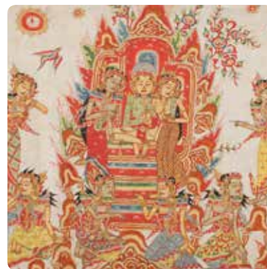
THE TEMPTATION OF ARJUNA: A TALE OF SPIRITUAL TRIUMPH Through November 10