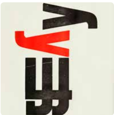
JACK STAUFFACHER: TYPOGRAPHIC EXPERIMENTS Through July 21