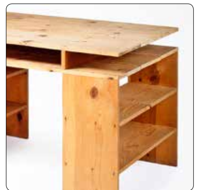
DONALD JUDD Through August 4