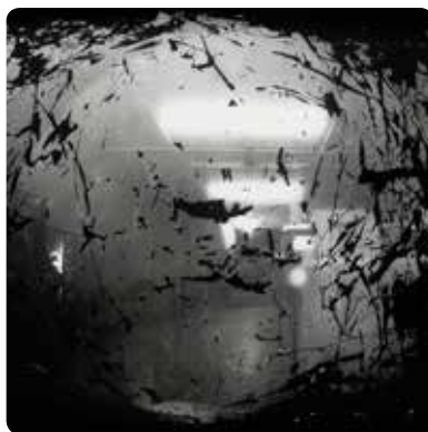
MOMENTS MEASURED Through April 29