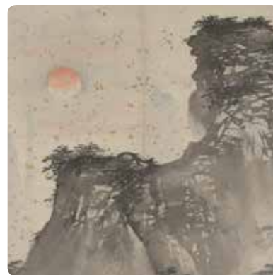
MING MASTERPIECES FROM THE SHANGHAI MUSEUM Through June 2