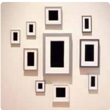
ENDS AND EXITS: CONTEMPORARY ART FROM THE COLLECTIONS OF LACMA AND THE BROAD ART FOUNDATION Through August 4