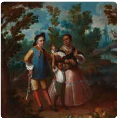
LATIN AMERICAN ART: NEW INSTALLATION Now on view