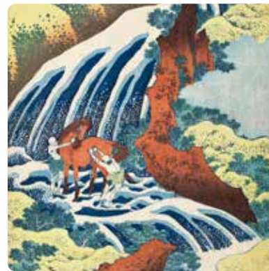
JAPANESE PRINTS: HOKUSAI AT LACMA Opens April 13 | Through July 28