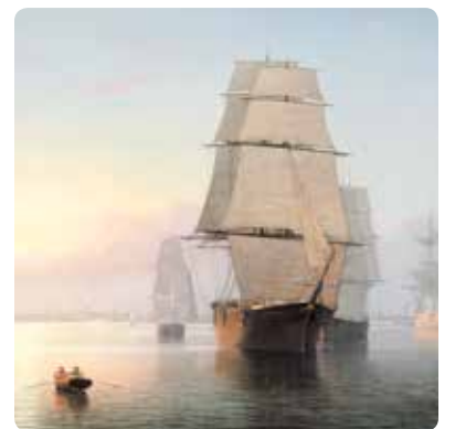
COMPASS FOR SURVEYORS: NINETEENTH-CENTURY AMERICAN LANDSCAPES Through 2014