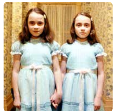
STANLEY KUBRICK Through June 30