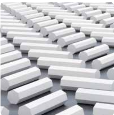
WALTER DE MARIA: THE 2000 SCULPTURE Through April 1