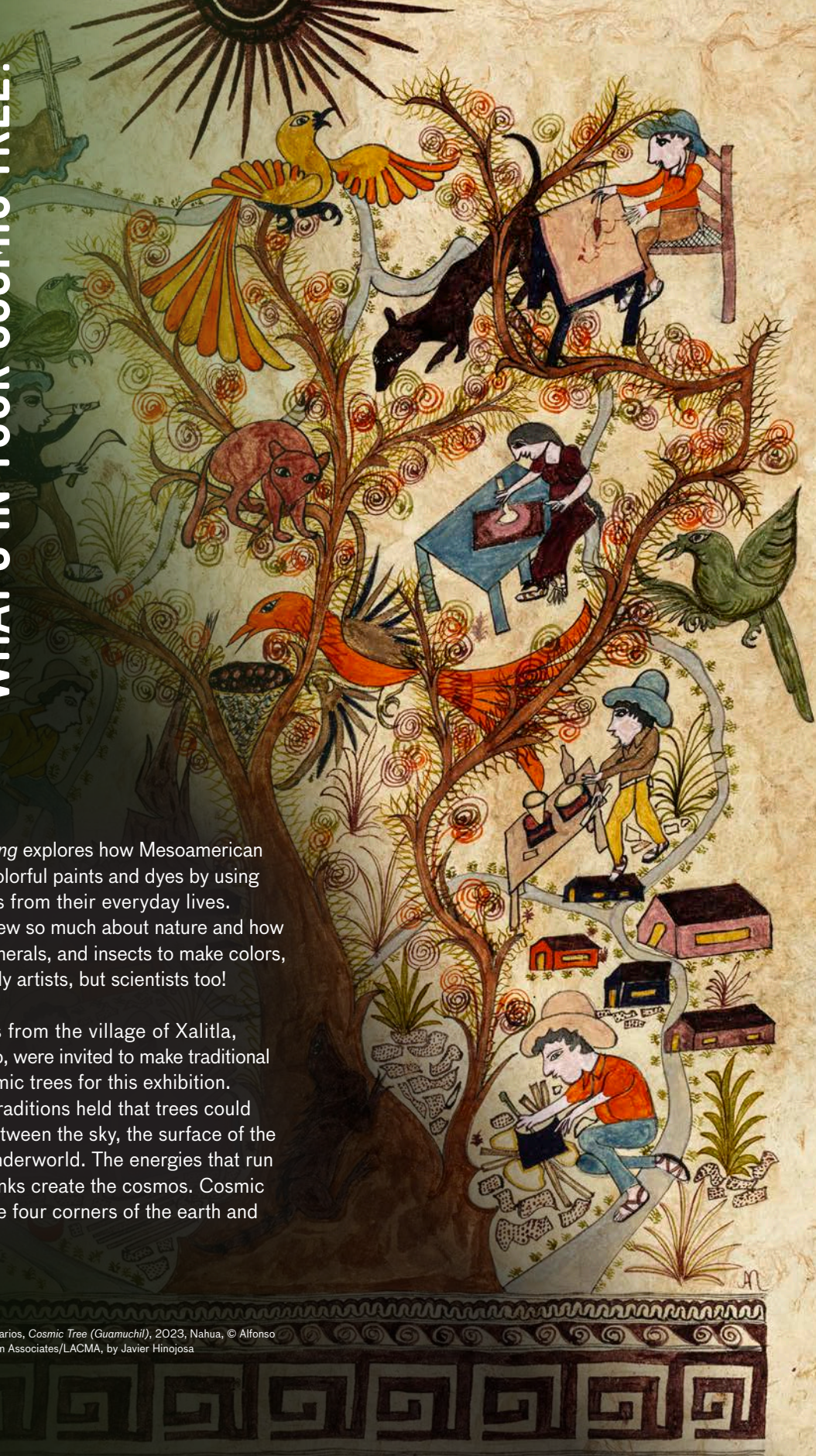
Image Credit: Alfonso Nava Larios, Cosmic Tree (Guamuchil) , 2023, Nahua, © Alfonso Nava Larios, photo © Museum Associates/LACMA, by Javier Hinojosa

Recently, artists from the village of Xalitla, Guerrero, Mexico, were invited to make traditional paintings of cosmic trees for this exhibition. Mesoamerican traditions held that trees could communicate between the sky, the surface of the earth, and the underworld. The energies that run through their trunks create the cosmos. Cosmic trees stand at the four corners of the earth and hold up the sky.