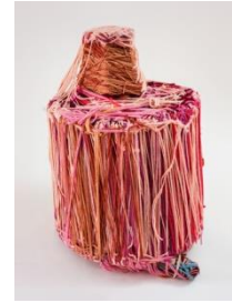
Outliers and American Vanguard Art