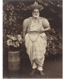
The Jeweled Isle: Art from Sri Lanka