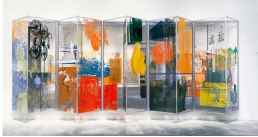
Robert Rauschenberg: The 1/4 Mile