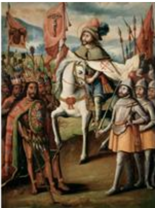
51. St. James with the Armies of Cortés and Moctezuma (Santiago Caballero con los ejércitos de Cortés y Moctezuma) Mexico, 18 th century Oil on canvas 62 2/5 x 50 7/10 in. (160 x 130 cm) Museo de las Culturas de Oaxaca, CONACULTA–INAH, Oaxaca, Mexico