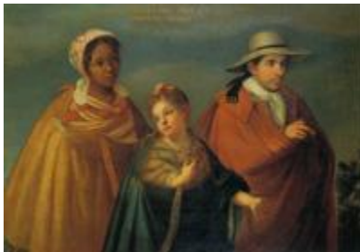
59. Circle of Juan Rodríguez Juárez (Mexico, 1675–1728) Spaniard and Mulatta Produce a Morisca (De español y de mulata, produce morisca) , c. 1720 Part of a series of casta paintings Oil on canvas 40 1/2 x 57 3/4 in. (102.9 x 146.7 cm) Colección Pérez Simón, Mexico City