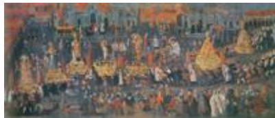
104. Corpus Christi Procession (Procesión de Corpus Christi)