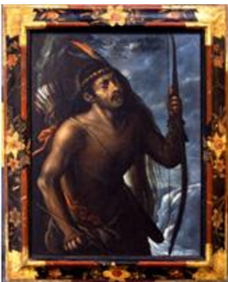
98. Manuel Arellano (Mexico, active 1691–1722) Rendition of a Chichimeco, Native of the Province of Parral (Diseño de chichimeco, natural del partido de Parral) , 1711