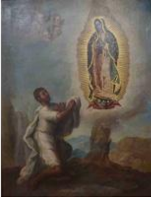
69. Miguel Cabrera (Mexico, c. 1715–1768) Third Apparition of the Virgin of Guadalupe (La tercera aparición de la Virgen de Guadalupe), 1751