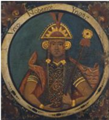
116. Urco, 9th Inca (Urco, noveno Inca) Peru, mid-18 th century From a series of fourteen portraits of Inca rulers Oil on canvas 23 7/16 x 21 9/16 in. (59.5 x 54.8 cm) Brooklyn Museum, 1995.29.9 (see credit line above)