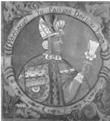
117. Pachacuti, 10th Inca (Pachacuti, décimo Inca) Peru, mid-18 th century From a series of fourteen portraits of Inca rulers Oil on canvas 23 9/16 x 21 9/16in. (59.8 x 54.8 cm) Brooklyn Museum, 1995.29.10 (see credit line above)