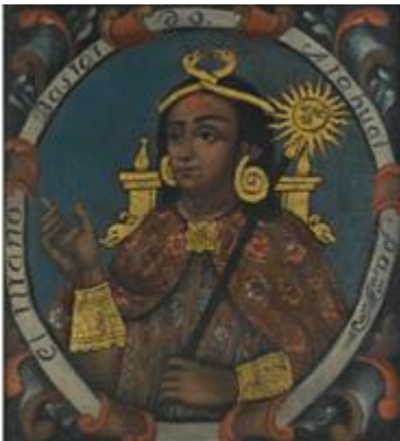
121. The Tyrant Bastard Atahualpa, 14th Inca (El tirano bastardo Atahualpa, decimocuarto Inca) Peru, mid-18 th century From a series of fourteen portraits of Inca rulers Oil on canvas 23 5/8 x 21 3/4 in. (60 x 55.2 cm) Brooklyn Museum, 1995.29.14 (see credit line above)