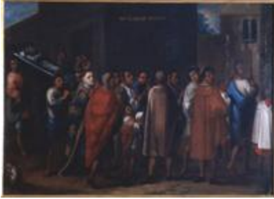
95. Circle of Juan Rodríguez Juárez (Mexico, 1675–1728) Indian Burial (Entierro de indios) , c. 1725