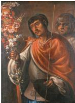
97. Attributed to Manuel Arellano (Mexico, active 1691–1722)

Museo Nacional de Historia, CONACULTA–INAH, Mexico City