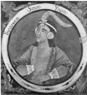
113. Inca Roca, 6th Inca (Inca Roca, sexto Inca) Peru, mid-18 th century From a series of fourteen portraits of Inca rulers Oil on canvas 23 3/8 x 21 1/2 in. (59.4 x 54.6 cm) Brooklyn Museum, 1995.29.6 (see credit line above)