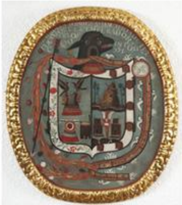
124. Coat of Arms of Texcoco (Escudo de armas de Texcoco)

Cuzco Circle, Pastor Family Collection, Lima, Peru