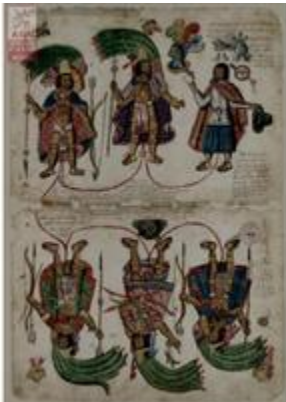
125. Genealogy of the House of Moctezuma (Genealogía de la Casa de Moctezuma)