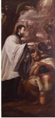
82. Juan Rodríguez Juárez (Mexico, 1675–1728) St. Francis Xavier Baptizing (San Francisco Xavier bautizando), 1693