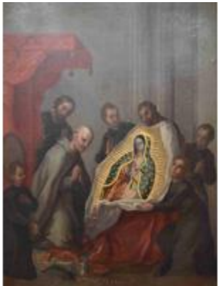
70. Miguel Cabrera (Mexico, c. 1715–1768) Fourth Apparition of the Virgin of Guadalupe (La cuarta aparición de la Virgen de Guadalupe), 1751

Museo de la Basílica de Guadalupe, Mexico City