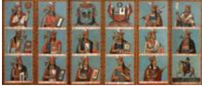
123. Marcos Chillitupa Chávez (Cuzco, active 1820–40) Folding Screen with the Genealogy of the Incas (Biombo con la genealogía de los incas) , 1837