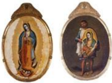
74. José de Ibarra (Mexico, 1688–1756) Virgin of Guadalupe (front) and Juan Diego (back) (Virgen de Guadalupe [anverso] y Juan Diego [reverso]) , 1743 Oil on canvas 51 3/16 X 35 7/16 in. (130x 90 cm) Catedral de México, CONACULTA–INAH–ITIOS Y MONUMENTOS, Mexico City