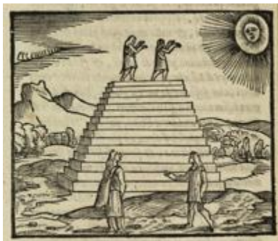
46. "How the Indians of Peru Adore the Sun" ("Como los indios del Perú adoran el sol y lo tienen por su principal ídolo") from Girolamo Benzoni's La historia del mondo nuovo (Venice, 1565) 6 1/8 x 3 13/16 in. (15.5 x 9.75 cm) Research Library, The Getty Research Institute, Los Angeles, 85-B1769