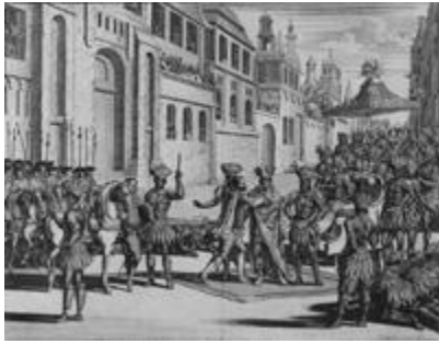
48. “The Meeting of Cortés and Moctezuma” (“El encuentro de Cortés y Moctezuma”) from Antonio de Solís’s The History of the Conquest of Mexico (London, 1704–33; first published in Spain, 1684) 13 5/8 x 16 5/16 in. (34.5 x 41.4 cm) Research Library, The Getty Research Institute, Los Angeles, 88-B14533