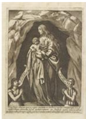
76. “Virgin of Arauco with Indian Donors” (Virgen de Arauco con donantes indígenas) from Alonso de Ovalle’s Historica relatione del regno de Chile (Rome, 1646; printed simultaneously in Spanish) 10 x 7 5/16 in. (25 x 18.5 cm) Research Library, The Getty Research Institute, Los Angeles, 95-B2799