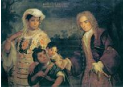
57. Circle of Juan Rodríguez Juárez (Mexico, 1675–1728) Spaniard and Indian Produce a Mestizo (De español y de india, produce mestizo) , c. 1720 Part of a series of casta paintings Oil on canvas 41 x 57 7/8 in. (104.1 x 147 cm) Colección Pérez Simón, Mexico City