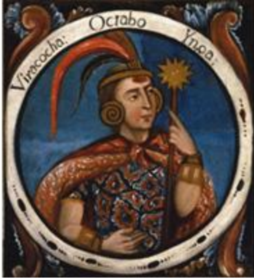
115. Viracocha, 8th Inca (Viracocha, octavo Inca) Peru, mid-18 th century From a series of fourteen portraits of Inca rulers Oil on canvas 23 3/8 x 21 9/16in. (59.4 x 54.8 cm) Brooklyn Museum, 1995.29.8 (see credit line above)