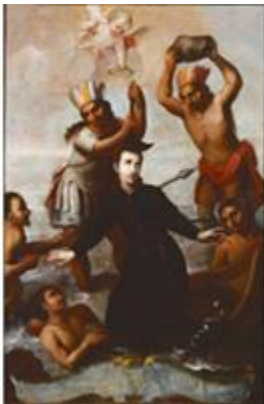
84. Pedro Andrade (Mexico, active 18th century)

Museo de Guadalupe, CONACULTA–INAH, Zacatecas, Mexico