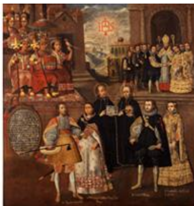
106. Marriage of Martín de Loyola to Princess Doña Beatriz, and Don Juan Borja to Princess Lorenza (Matrimonio de Martín de Loyola con Doña Beatriz Ñusta, y de Don Juan Borja con Lorenza Ñusta)