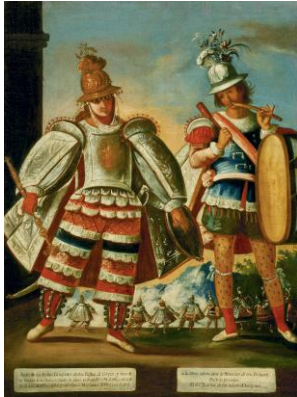
103. Dress of the Dancing Indians at the Corpus Christi Festival and Others of the City of La Plata (Trajes de los indios danzantes en las fiestas de Corpus y otras de la ciudad de La Plata)