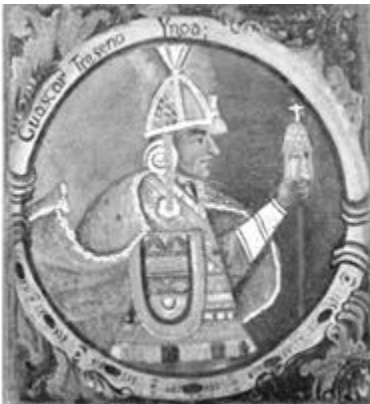
120. Huascar, 13th Inca (Huascar, decimotercer Inca) Peru, mid-18 th century From a series of fourteen portraits of Inca rulers Oil on canvas 23 1/2 x 21 1/2 in. (59.7 x 54.6 cm) Brooklyn Museum, 1995.29.13 (see credit line above)