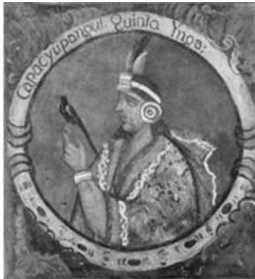
112. Capac Yupanqui, 5th Inca (Cápac Yupanqui, quinto Inca) Peru, mid-18 th century From a series of fourteen portraits of Inca rulers Oil on canvas 23 1/2 x 21 3/4 in. (59.7 x 55.2 cm) Brooklyn Museum, 1995.29.5 (see credit line above)