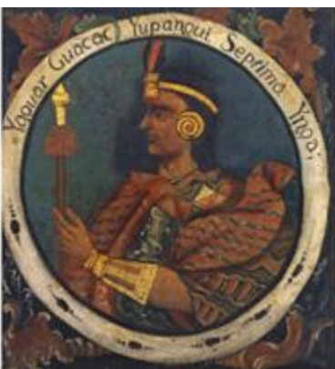
114. Yahuar Huacac, 7th Inca (Yáhuar Huácac, séptimo Inca) Peru, mid-18 th century From a series of fourteen portraits of Inca rulers Oil on canvas 23 3/8 x 21 9/16 in. (59.4 x 54.8 cm) Brooklyn Museum, 1995.29.7 (see credit line above)