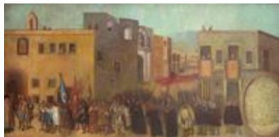
105. Transference of the Image of the Jesus of Nazareth to the Hospital de la Purísima Concepción (Transferencia de la imagen del Nazareno al Hospital de la Purísima Concepción)