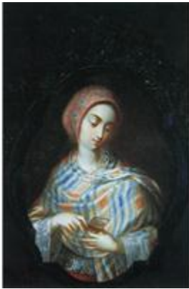
96. Juan Rodríguez Juárez (Mexico, 1675–1728) Woman with Snuff Box Illustrating an Indian Wedding (Dama con caja de rapé ilustrando un desposorio indígena) , c. 1720