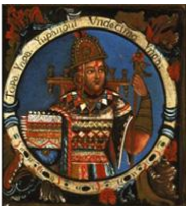
118. Tupac Yupanqui, 11th Inca (Túpac Yupanqui, undécimo Inca) Peru, mid-18 th century From a series of fourteen portraits of Inca rulers Oil on canvas 23 1/8 x 21 1/4 in. (58.7 x 54.0 cm) Brooklyn Museum, 1995.29.11 (see credit line above)