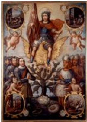
50. San Hipólito and Mexico’s Coat of Arms (San Hipólito y las armas mexicanas) Mexico, 1764 Oil on canvas 66 3/8 x 47 1/4 in. (168.5 x 120 cm) Museo Franz Mayer, Mexico City