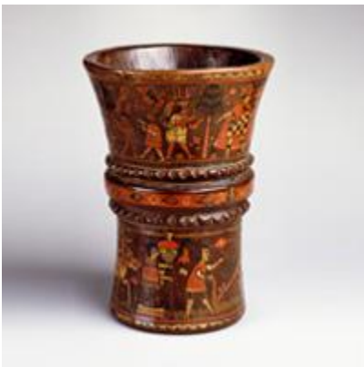
101. Quero Depicting Incas Battling Chunchos (Quero representando una batalla de incas contra chunchos)