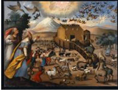
56. Noah's Ark (El Arca de Noé) Ecuador, Quito school, late 18th–early 19th century Oil on canvas 35 x 47 in. (88.9 x 119.4 cm) The Marilynn and Carl Thoma Collection, Chicago