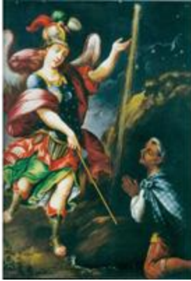
73. Juan Tinoco (Mexico, 1641–1703) The Apparition of San Miguel del Milagro to Diego Lázaro (La aparición de San Miguel del Milagro a Diego Lázaro) , 17th century Oil on copper 20 ½ x 16 ½ in. (52 x 42 cm) Ochoavo Chapel, Cathedral of Puebla, CONACULTA–INAH–SITIOS Y MONUMENTOS, Puebla, Mexico