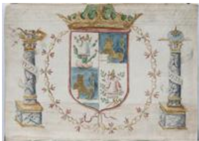
126. Coat of Arms of Motecuhzoma Xocoyotzin and of Motecuhzoma Ilhuicamina (Escudo de armas de Motecuhzoma Xocoyotzin y de Motecuhzoma Ilhuicamina)

Archivo General de la Nación, Mexico City