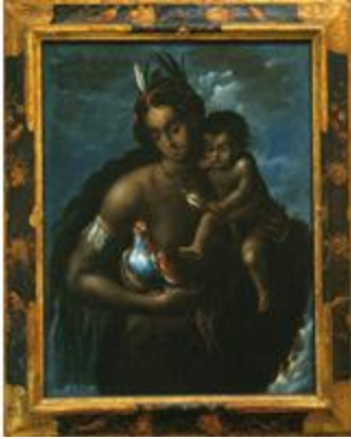
99. Manuel Arellano (Mexico, active 1691–1722) Rendition of a Chichimeca, Native of the Province of Parral (Diseño de chichimeca, natural del partido de Parral), 1711