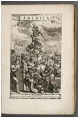
45. "America," from Arnoldus Montanus's Die Nieuwe en Onbekende Weereld (Amsterdam, 1671) 15 3/8 x 10 1/4 in. (39 x 26 cm) Research Library, The Getty Research Institute, Los Angeles, 93-B9309