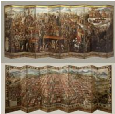
47. Folding Screen with the Conquest of Mexico (front) and View of the City of Mexico (back) ( Biombo con la conquista de México [anverso] y vista de la ciudad de México [reverso] ) Mexico, late 17th century Oil on canvas Ten-panel folding screen, overall: 82 11/16 x 220 1/2 in. (210 x 560 cm) Collection of Vera Da Costa Autrey