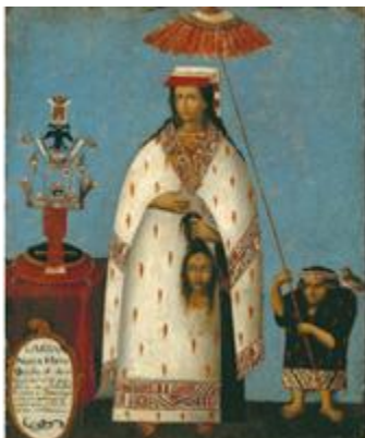
122. Great Princess Mama Ocllo (La gran ñusta Mama Ocllo) Peru, Cuzco school, c. 1800 Oil on canvas 18 1/16 x 14 7/8 in. (45.8 x 37.7 cm) Denver Art Museum, Gift of Dr. Belinda Straight by exchange and New World Acquisition Fund