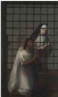
71. Praying Indian and Cloistered Capuchin Nun (Indio rezando y monja capuchina de clausura)

Museo de la Basílica de Guadalupe, Mexico City