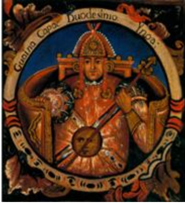
119. Huayna Capac, 12th Inca (Huayna Cápac, duodécimo Inca) Peru, mid-18 th century From a series of fourteen portraits of Inca rulers Oil on canvas 23 1/2 x 21 1/2 in. (59.7 x 54.6 cm) Brooklyn Museum, 1995.29.12 (see credit line above)