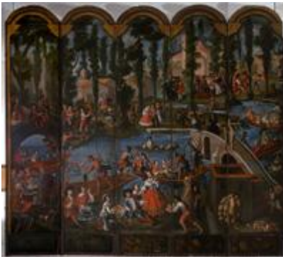
100. Folding Screen with Indian Wedding and Paseo de Ixtacalco (Biombo con desposorio de indios y paseo de Ixtacalco)