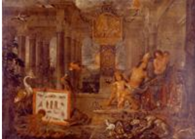
44. Ferdinand Van Kessel, Antwerp, 1648–1696 Allegory of Brazil (Alegoría de Brasil) , c. 1661 Oil on canvas 18 1/8 x 26 x 1 in. (46 x 66 x 2.5 cm) Museo Franz Mayer, Mexico City