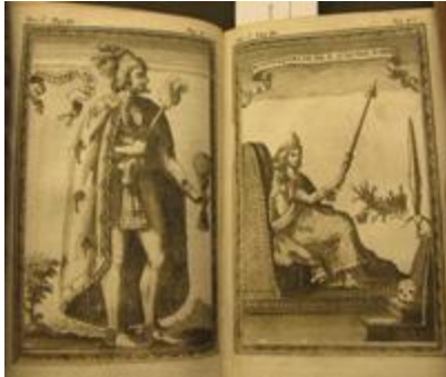
49. “Aztec Emperors Ahuizotl and Moctezuma” (“Emperadores mexica Ahuizotl y Moctezuma”) from Giovanni Francesco Gemelli Careri’s Giro del mondo (Naples, 1699) 7 x 6 7/10 in. (18 x 12 cm) Research Library, The Getty Research Institute, Los Angeles, 2698-167