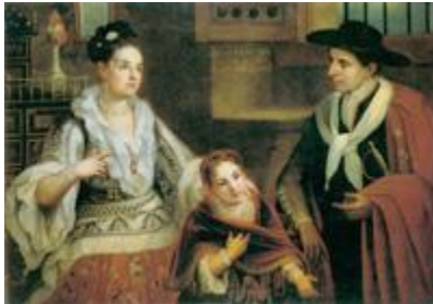
58. Circle of Juan Rodríguez Juárez (Mexico, 1675–1728) Castizo and Spaniard Produce a Spaniard (De castizo y de española, produce española) , c. 1720 Part of a series of casta paintings Oil on canvas 40 3/4 x 57 1/4 in. (103.5 x 145.4 cm) Colección Pérez Simón, Mexico City