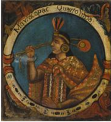
111. Mayta Capac, 4th Inca (Mayta Cápac, cuarto Inca) Peru, mid-18 th century From a series of fourteen portraits of Inca rulers Oil on canvas 23 1/2 x 21 1/2 in. (59.7 x 54.6 cm) Brooklyn Museum, 1995.29.4 (see credit line above)