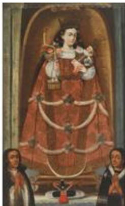
75. Painting of the Statue of the Virgin of Candelaria with Donors (Pintura de la talla de la Virgen de Candelaria con donantes) Peru, Cuzco school, early to mid–18th century Oil on canvas 60 x 30 in. (152.4 x 76.2 cm) Private collection