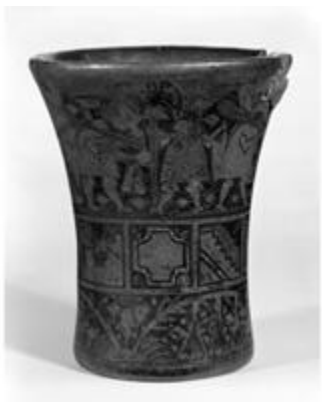
102. Quero Depicting Chuncho Dance (Quero representando danza de chunchos)

Brooklyn Museum, A. Augustus Healy Fund, 42.149