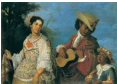
60. Circle of Juan Rodríguez Juárez (Mexico, 1675–1728) Mulatto and Mestiza Produce a Mulatto Return-Backwards (De mulato y mestiza, produce mulato es torna atrás) , c. 1720 Part of a series of casta paintings Oil on canvas 40 1/2 x 56 3/4 in. (102.9 x 144.1 cm) Colección Pérez Simón, Mexico City