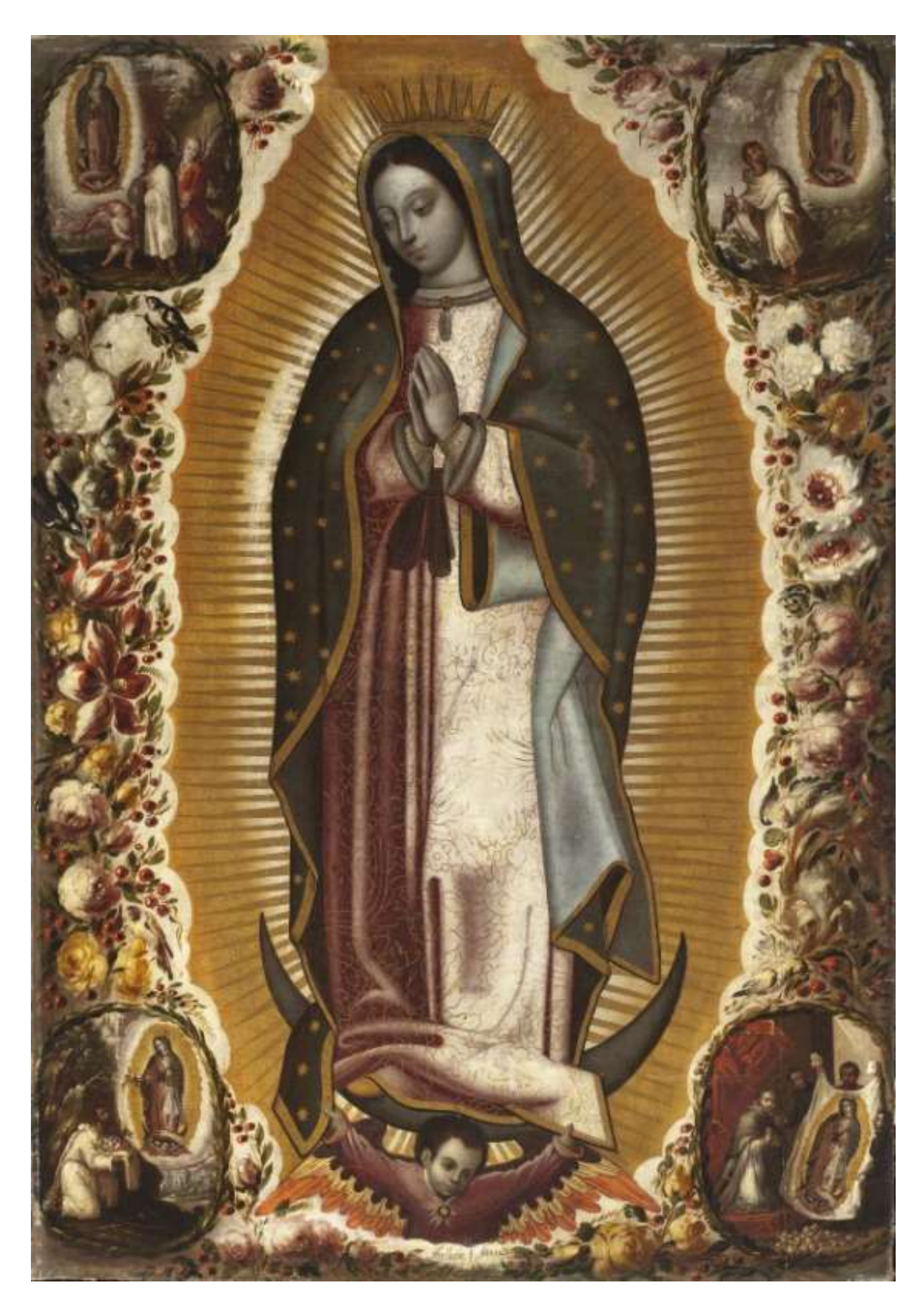
Virgin of Guadalupe (La Virgen de Guadalupe)

\begin{array}{c} \text{Manuel de Arellano} \\ \text{(Mexico, active 1691-circa 1722). 1691} \\ \text{Paintings, oil on canvas: 71}^{7}/_{16} \text{ x }48^{9}/_{16} \text{ in. (181.45 x 123.38 cm)} \\ \text{Framed: }82\% \text{ x }60\% \text{ x }3\% \text{ in. (208.92 x 153.04 x 8.89 cm)} \\ \text{Purchased with funds provided by the Bernard and Edith Lewin Collection of Mexican Art Deaccession Fund (M.2009.61)} \\ \text{http://collections.lacma.org/node/220044} \\ \end{array}