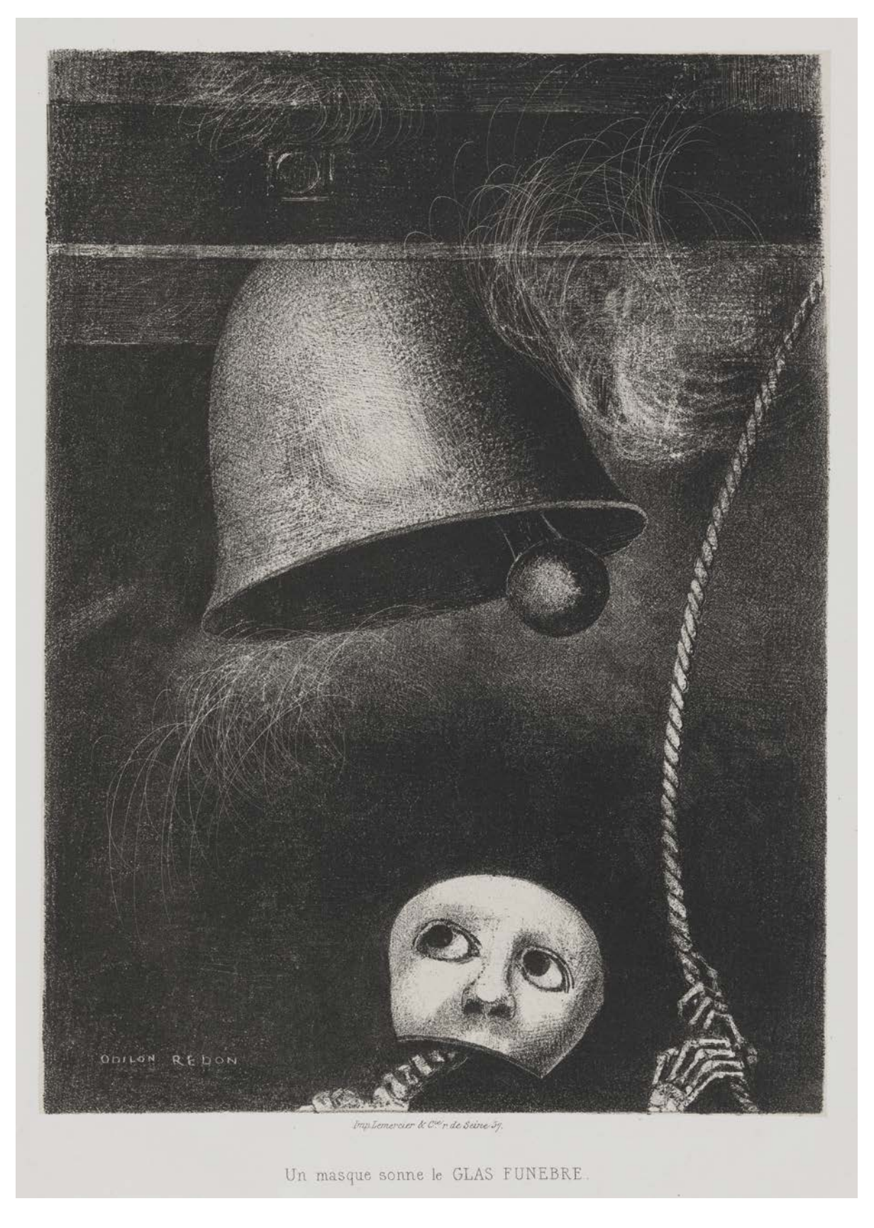
À Edgar Poe (Un masque sonne le glas funèbre) (To Edgar Poe [A Mask Sounds the Death Knell]) 1882 Odilon Redon Lithograph 17 5/8 × 12 1/4 in. (44.77 × 31.12)

Los Angeles County Museum of Art, Wallis Foundation Fund in memory of Hal B. Wallis (AC1997.14.1.3)