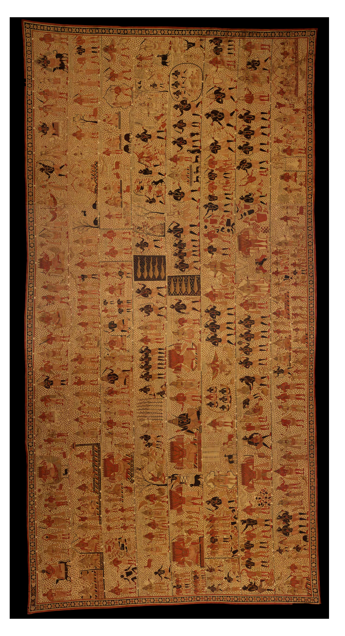
Sri Lanka, Temple hanging, 19th century, painted and dyed cotton; 108½ × 214 in., The Victoria and Albert Museum (5440[IS]), © Victoria and Albert Museum, London