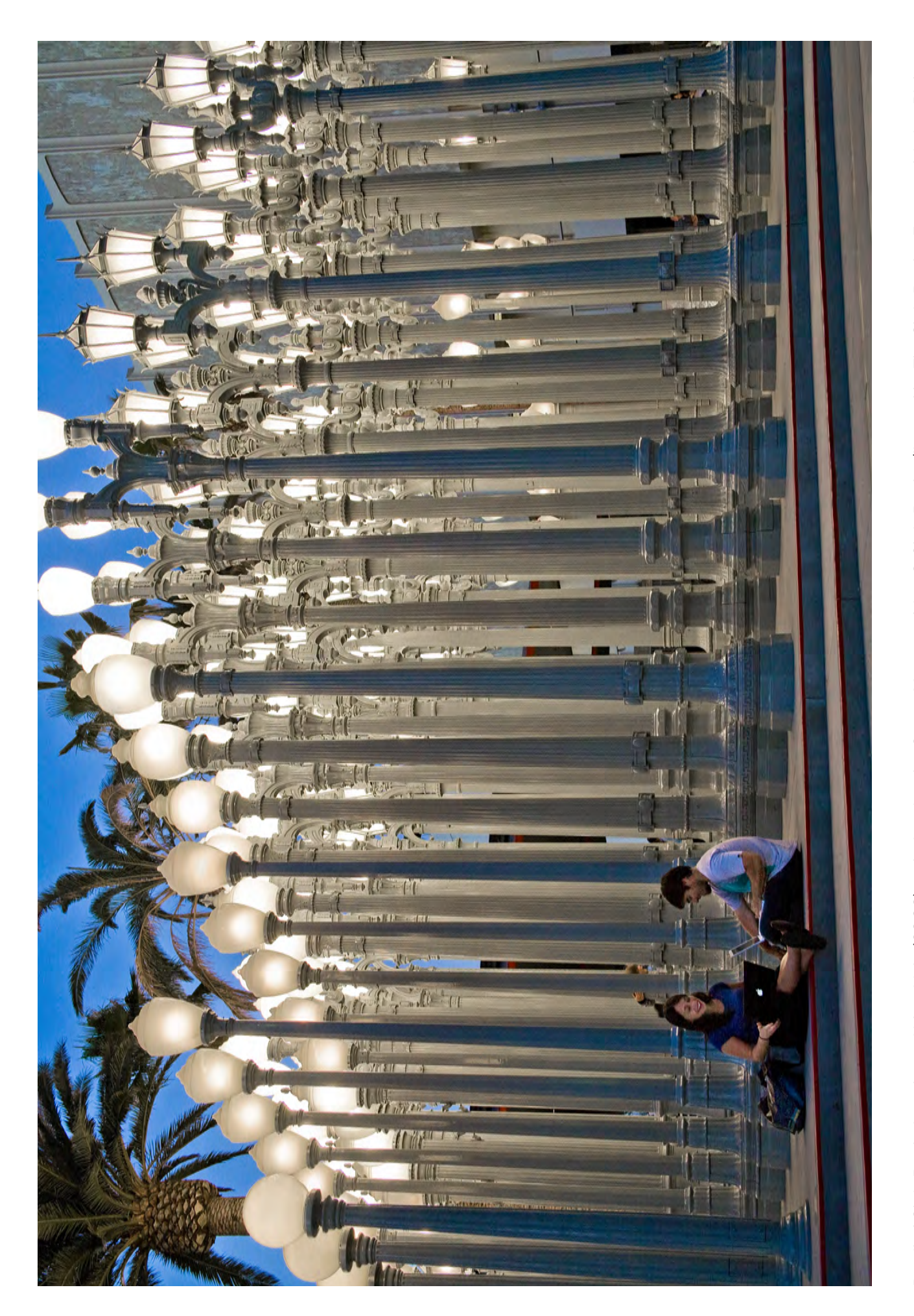
Detail of Chris Burden's sculpture Urban Light (2008) at the Los Angeles County Museum of Art, © Chris Burden/licensed by The Chris Burden Estate and Artists Rights Society (ARS), New York