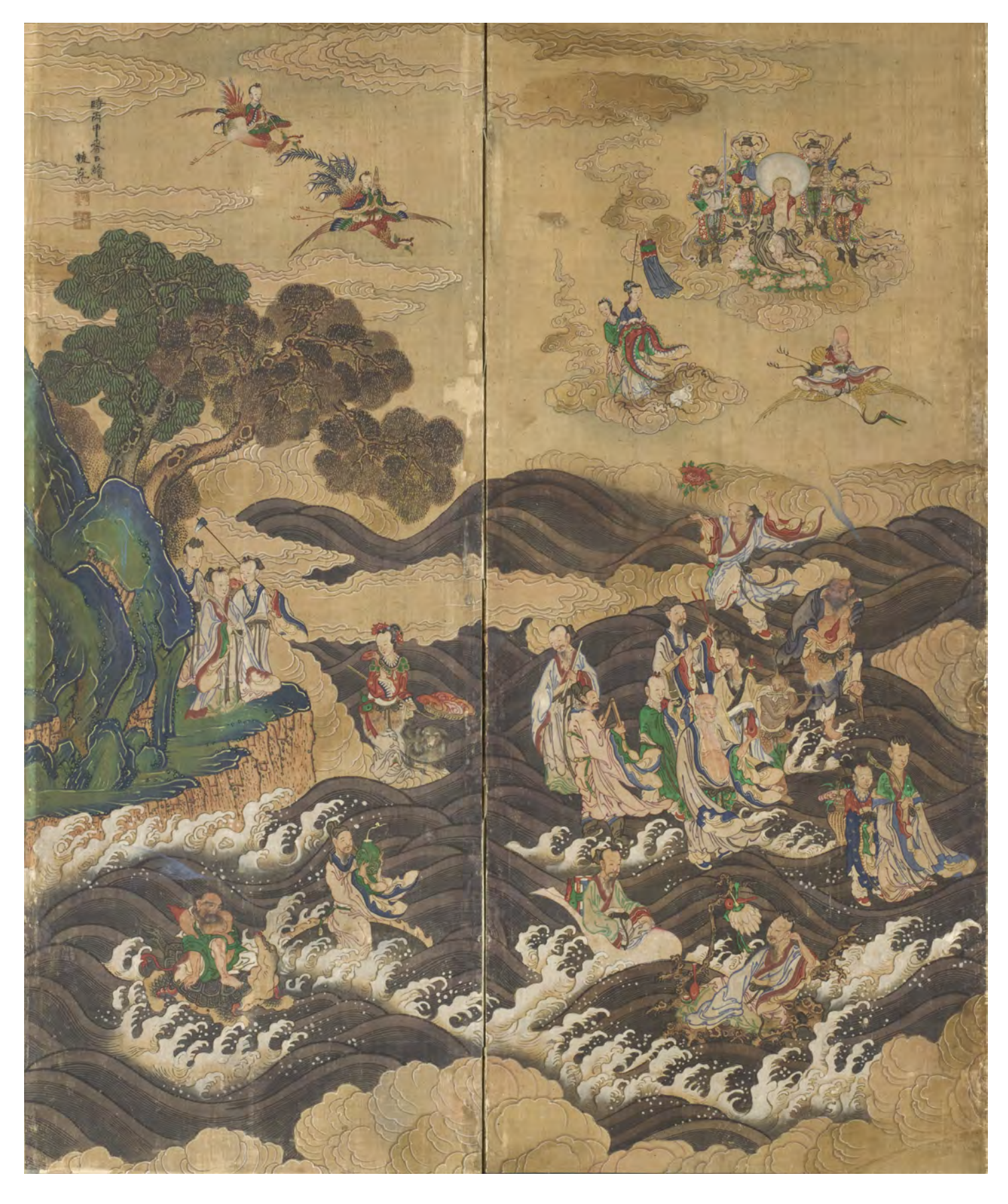
Detail of Korea, The Banquet of Seowangmo (Xiwangmu) , Queen Mother of the West, Joseon dynasty (1392–1910), 18th–19th century