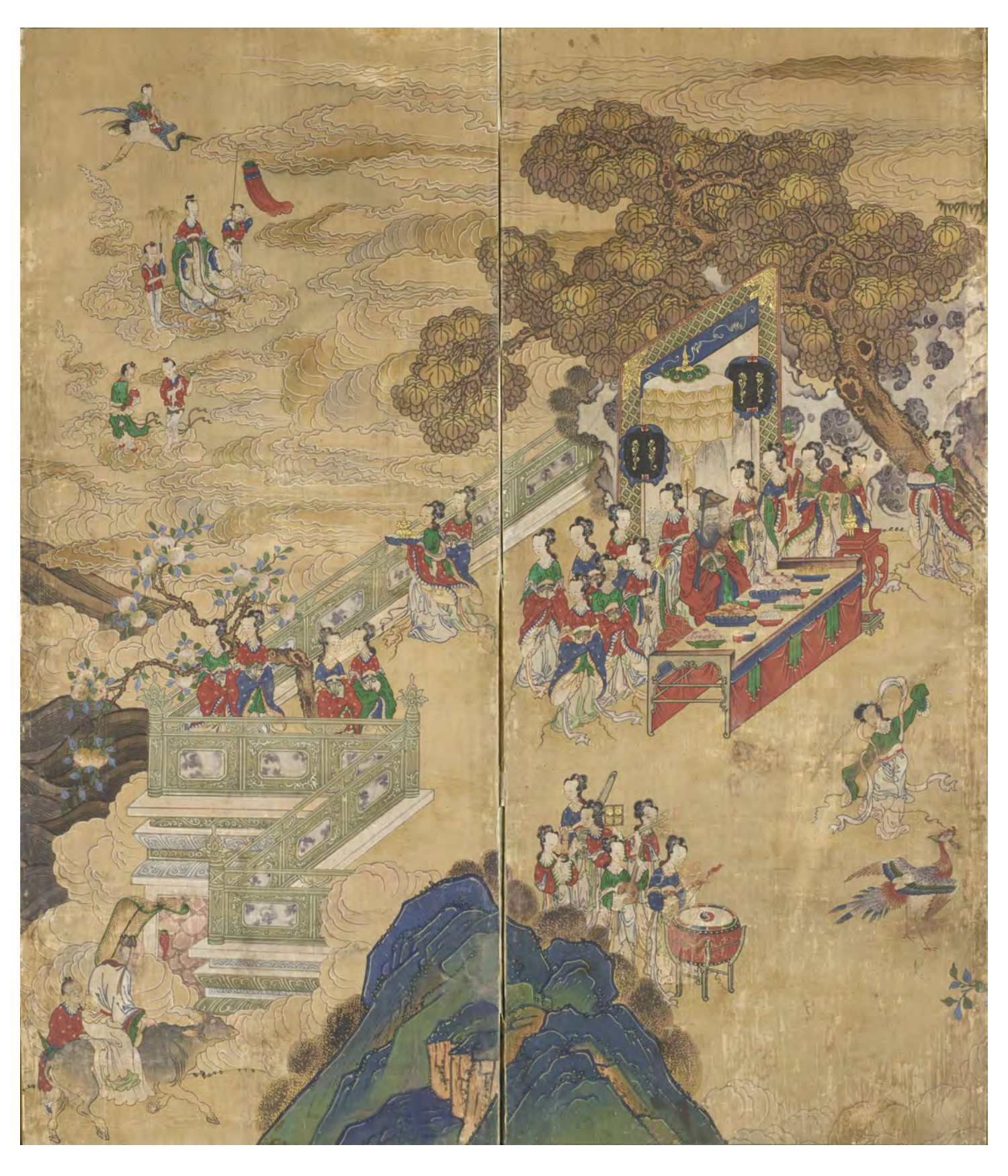
Detail of Korea, The Banquet of Seowangmo (Xiwangmu) , Queen Mother of the West, Joseon dynasty (1392–1910), 18th–19th century