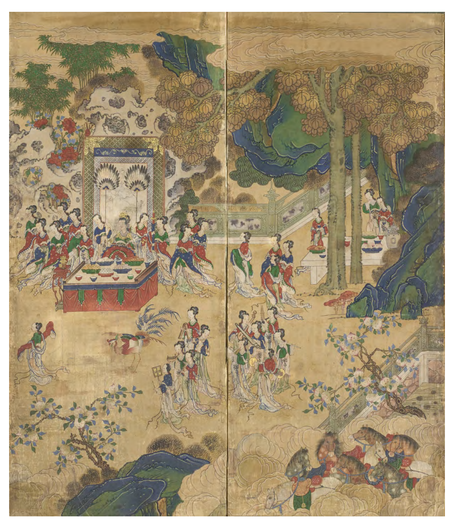
Detail of Korea, The Banquet of Seowangmo (Xiwangmu) , Queen Mother of the West, Joseon dynasty (1392–1910), 18th–19th century