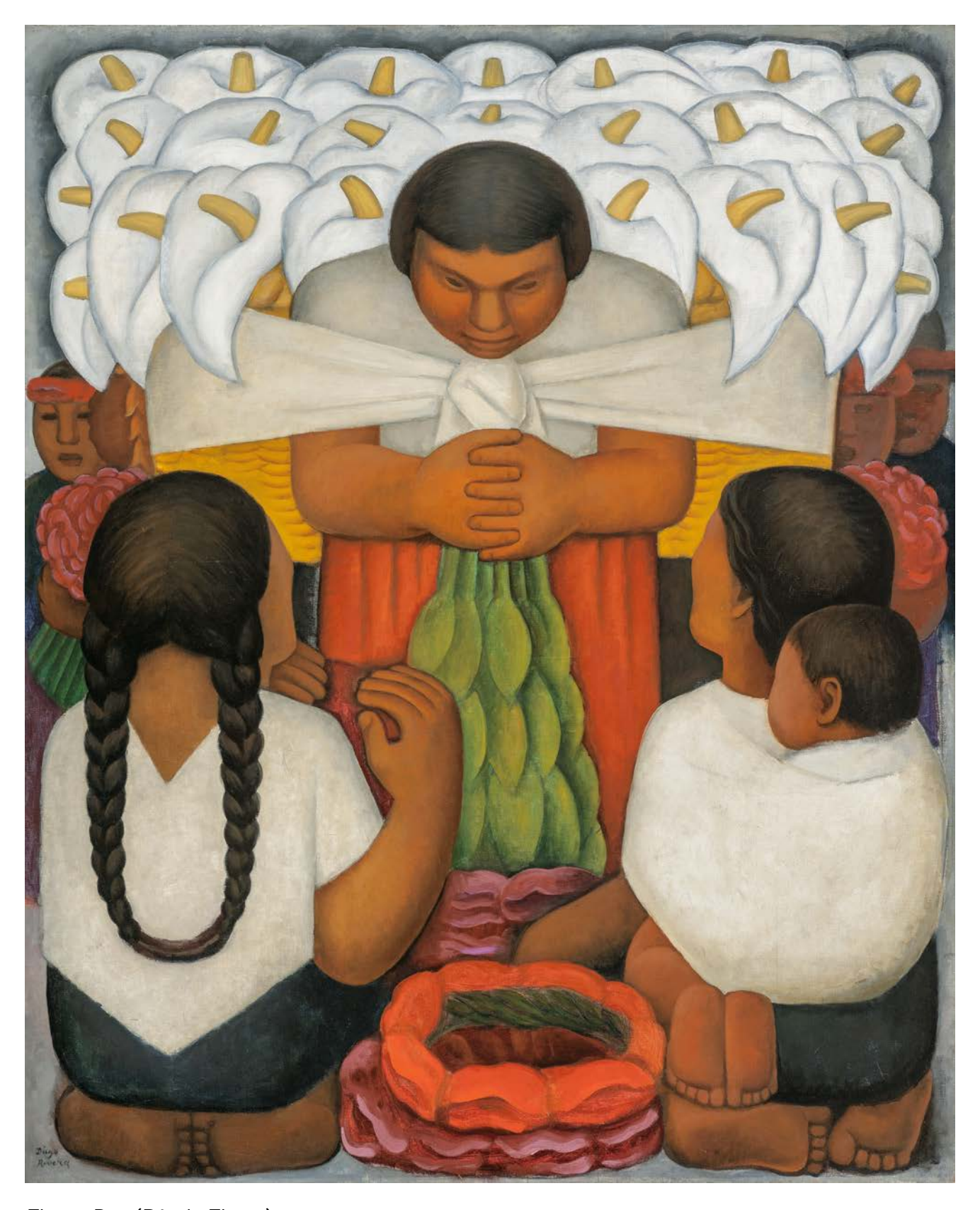
Flower Day (Día de Flores) Diego Rivera, 1886–1957, Oil on canvas 58 × 47 ½ in.

Los Angeles County Museum of Art, Los Angeles County Fund (25.7.1), © 2016 Banco de México Diego Rivera Frida Kahlo Museums Trust, Mexico, D.F./Artists Rights Society (ARS), New York