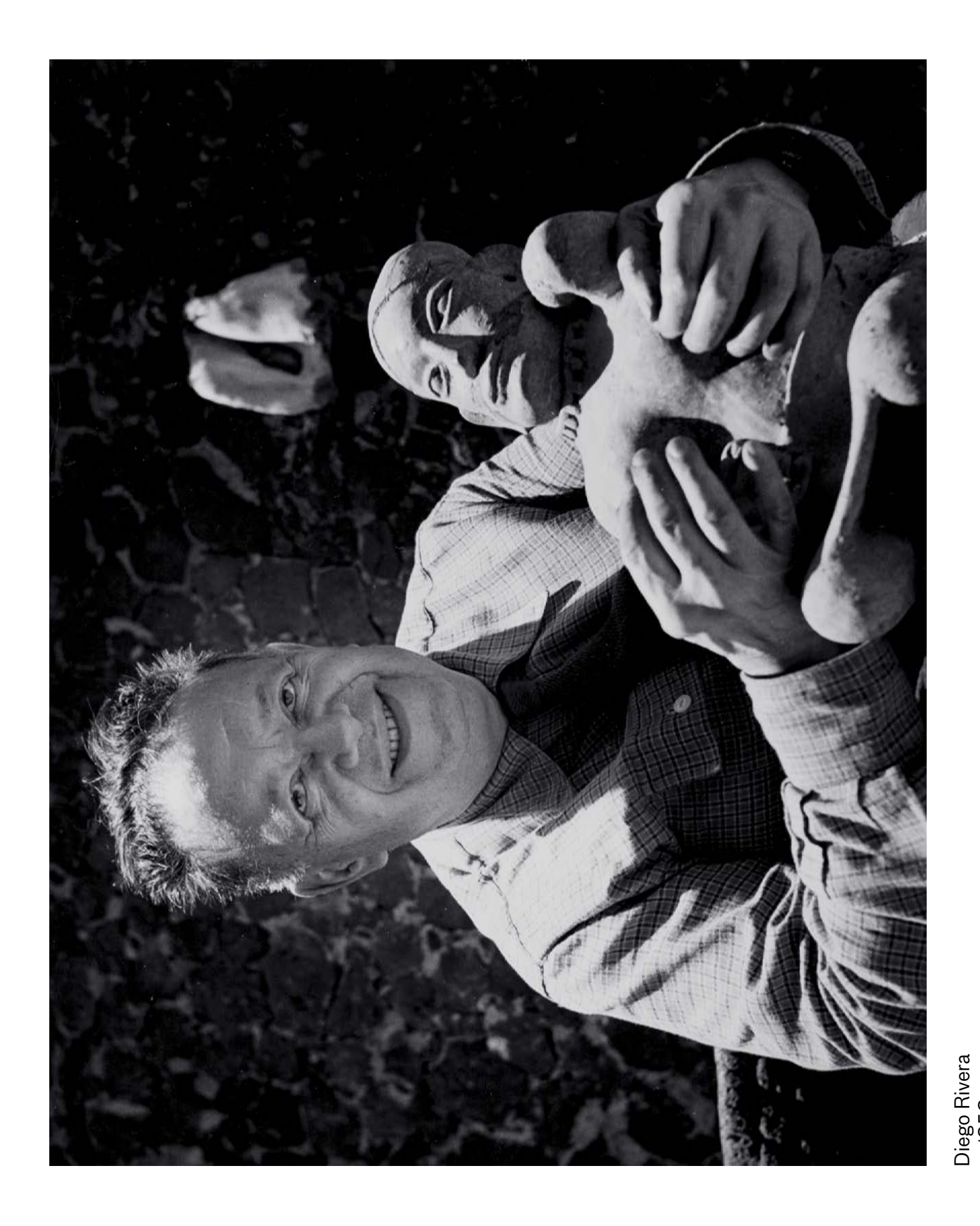
Diego Rivera c. 1950s