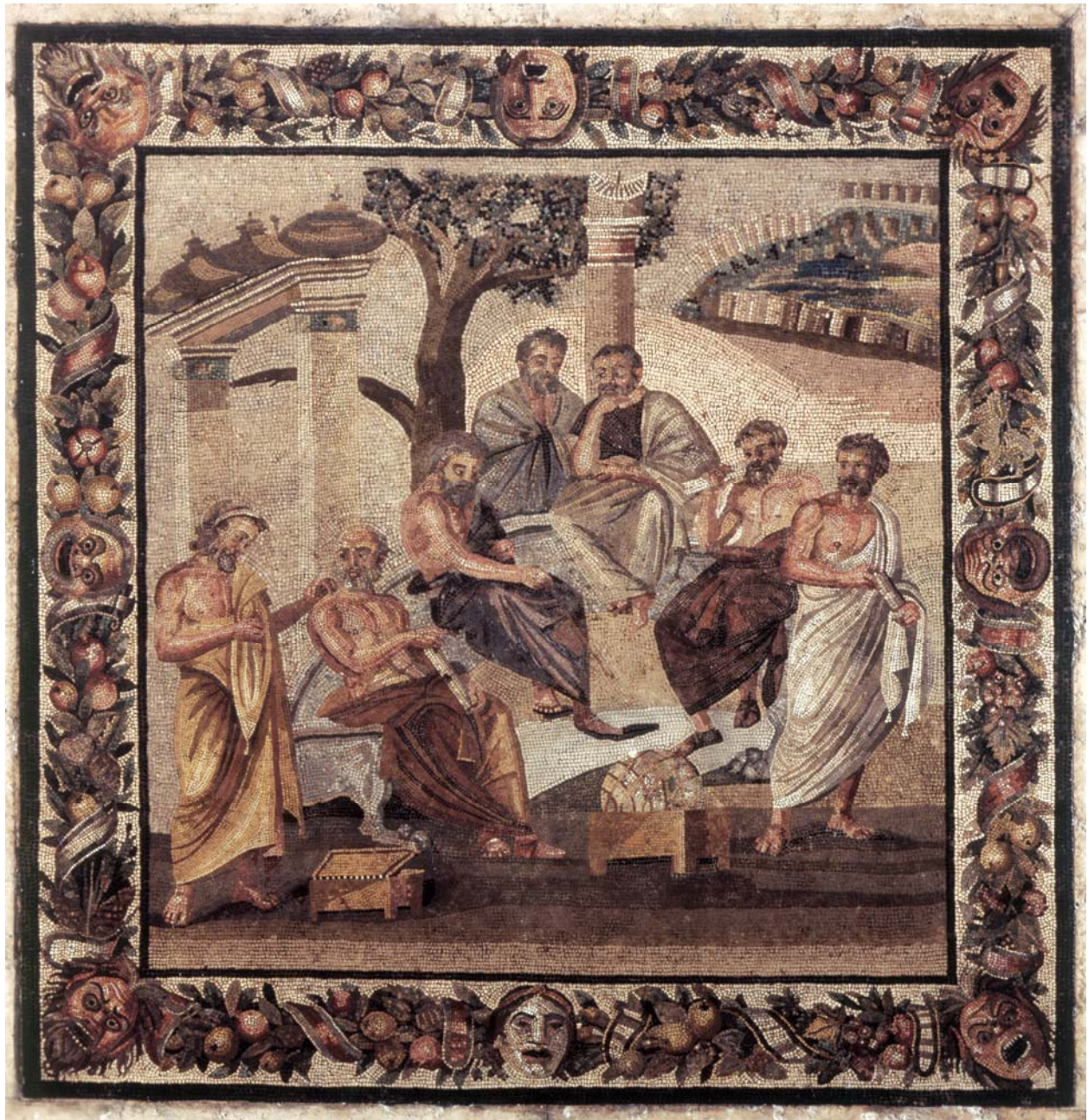
PLATO'S ACADEMY 1st century BC–1st century AD Pompeii, Villa of Titus Siminius Stephanus, in suburbs north of Vesuvian Gate, excavated between 1897 and 1900 Mosaic, 33 7 / 8 x 33 1 / 2 in. Soprintendenza Speciale per i Beni Archeologici de Napoli e Pompei Museo Archeologico Nazionale di Napoli