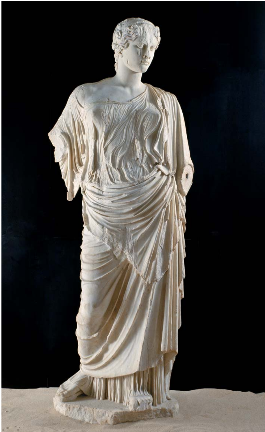
APHRODITE/VENUS (Syon House/Munich type) Probably early 1st century Rione Terra at Puteoli (Pozzuoli) Pentelic marble from near Athens, 80¼ in. Soprintendenza Speciale per i Beni Archeologici di Napoli e Pompei Museo Archeologico dei Campi Flegrei, Baia